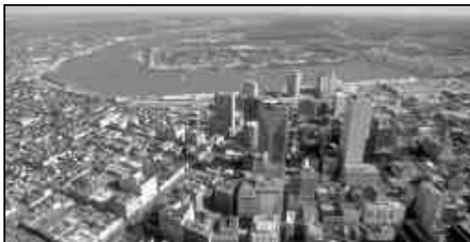
Situated on the banks of the mighty Mississippi River, the New Orleans skyline is one of the most recognizable in America.The city is a thriving metropolitan area that still maintains the traditional charm of a time long gone.

ter-mile canopy of giant live oak trees, believed to be 300 years old, is a spectacular site.