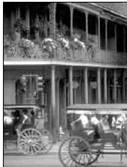
The French Quarter of New Orleans joins progressive technology with traditional Southern charm. Take a carriage ride through the heart of New Orleans and discover that even today it still maintains many of its traditional European roots.

hills. The state is known for its charm and friendly people, and still maintains the stately antebellum plantations and majestic oaks of its early days. The atmosphere is elegant, yet relaxed and casual. Dubbed the "Sportsman's Paradise," Louisiana offers some of the finest hunting, fishing and boating opportunities in the country.