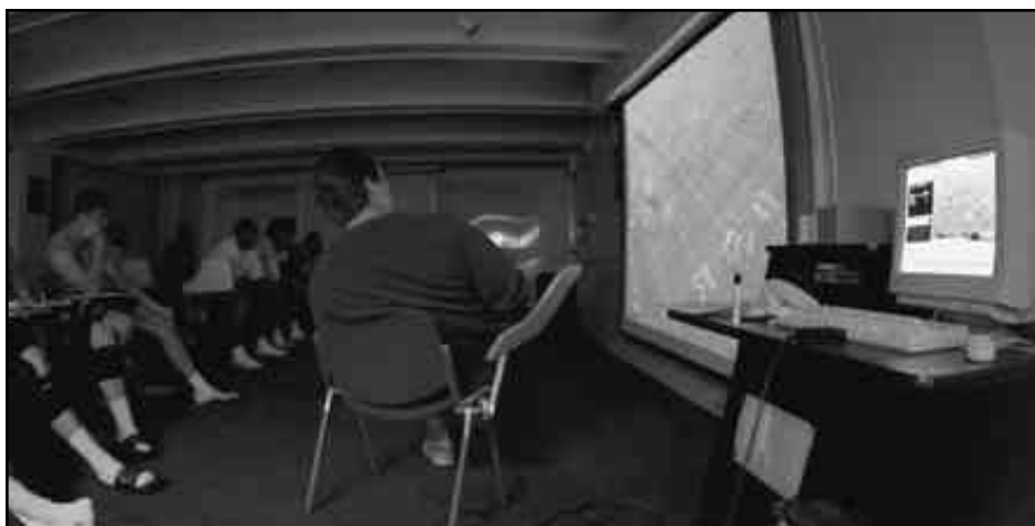
The Tigers have nine meeting rooms inside the Lawton Room to review tape and go over game plans for the upcoming week's opponent.

in a theater-like atmosphere. The main auditorium has state-of-the-art audio and visual components necessary for meetings, reviewing of game tapes and lectures. Nine additional rooms are used for individual position meetings.