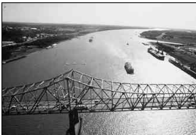
The Mississippi River with all of its might rolls through downtown Baton Rouge.

• The average annual temperature in Baton Rouge is 68 degrees and the city features a semi-tropical climate highlighted by mild winter months.