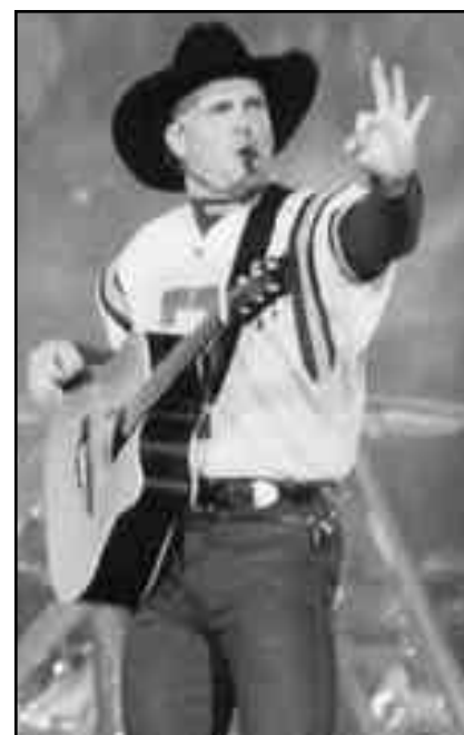
Garth Brooks donned an LSU football jersey when he played before a sell out crowd at the Pete Maravich Assembly Center.

Average Temperatures: HIGH . . . . .81.3 LOW . . . . .52.5 AVERAGE . . . . .67.5