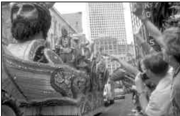
Millions of visitors from around the world come to New Orleans each year to participate in Mardi Gras, a two-week party that includes more than 60 parades.

L ouisiana, one of America's most culturally and geographically diverse states, is located in the heart of the Deep South. Adjacent to the Gulf of Mexico and dotted with hundreds of lakes and bayous, Louisiana is home to all types of terrain from swamps and marshes to lush forests and gentle