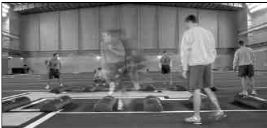
The Tigers conduct their entire winter conditioning program in the Indoor Practice Facility. The facility is also a short walk from the main practice fields, giving the Tigers a quick turnaround to continue practice when inclement weather hits.

practice facility. A new state-of-the-art turf, the same turf on which the Indianapolis Colts, the New York Jets and New York Giants play their games, was installed in the spring of 1998.