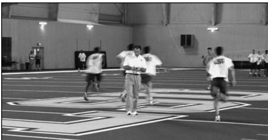
The Tigers conduct their entire winter conditioning program in the Indoor Practice Facility. The facility is also a short walk from the main practice fields, giving the Tigers a quick turnaround to continue practice when inclement weather hits.

A new state-of-the-art turf, the same turf on which the Indianapolis Colts, the New York Jets and New York Giants play their games, was installed in the spring of 1998.