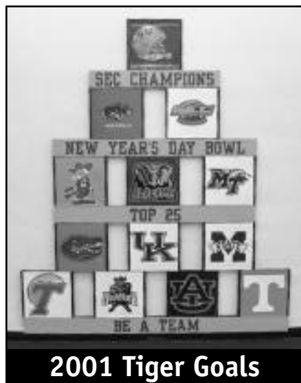
2001 Tiger Goals

With locker space for 115 athletes , the LSU football locker room is superior to that of many