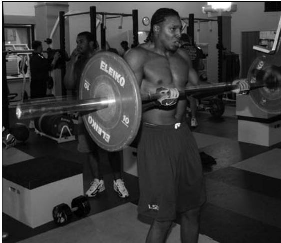
LIFT The 14 strength and conditioning staff members give LSU a good staff to student-athlete ratio.