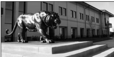
MAIN ENTRANCE WITH TIGER STATUE