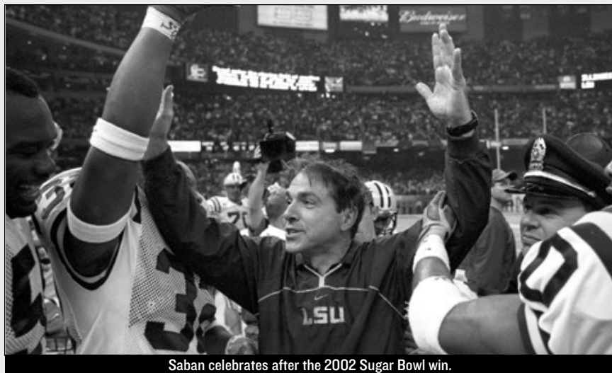
Saban celebrates after the 2002 Sugar Bowl win.

Saban leads the Tigers to their first back-to-back New Year's Day bowl games since the 1960s as LSU faces Texas in the Cotton Bowl in Dallas. One of the highlights of the season was "The Bluegrass Miracle" as LSU completes a 75-yard last-second Hail Mary pass to beat Kentucky, 33-30, in Lexington. The Bluegrass Miracle was called college football's "Play of the Year" by The Associated Press.