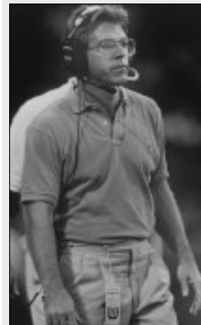
In the NFL as an assistant for the Cleveland Browns.

Saban returns to the NFL, making the Cleveland Browns' defense one of the strongest in the league in his role as defensive coordinator.