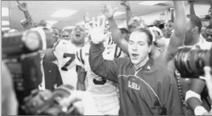
Coach Saban and the Tigers celebrate after receiving the 2002 Sugar Bowl Trophy.