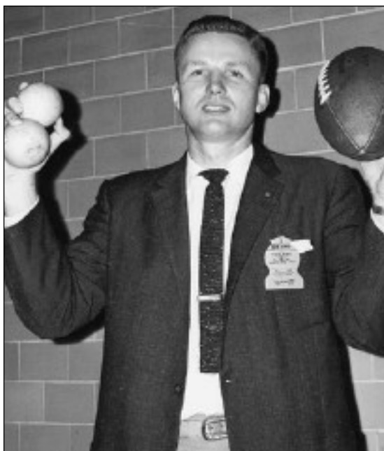
Paul Dietzel led the Tigers to the 1958 National Championship and the 1961 SEC Championship.