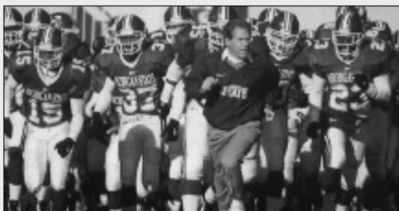
Saban was head coach at Michigan State for five years.

During his five-year tenure as head coach at