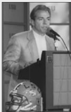
Saban addressing the Louisiana media at his first press conference.

Saban is named the 31st head coach in LSU football history.