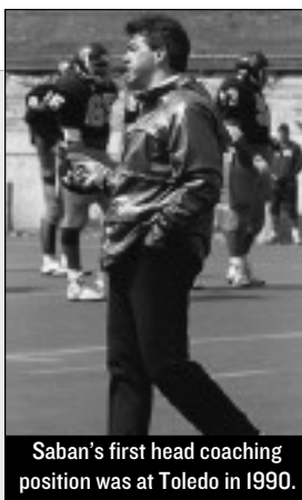
Saban's first head coaching position was at Toledo in 1990.

Saban begins his coaching career at his alma mater under Don James, first as a graduate assistant for two seasons, then as linebackers coach for two years.