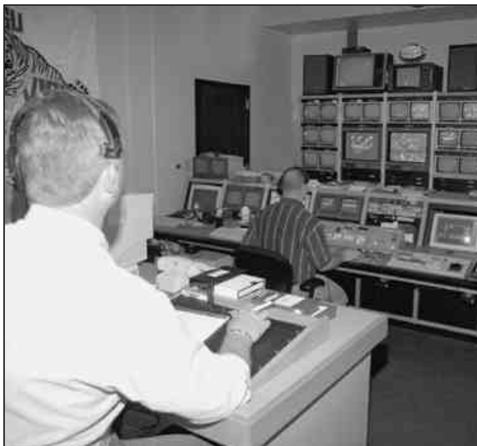
The Athletic Administration building houses a television control room that is used for video scoreboard broadcasts for football, basketball and gymnastics in Tiger Stadium and the Pete Maravich Assembly Center.