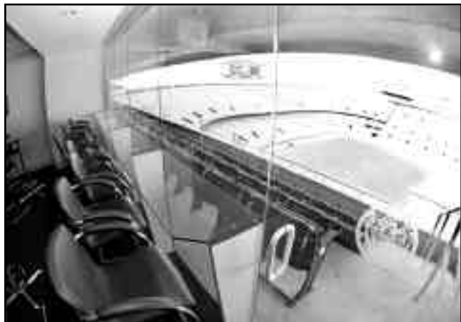
The Tiger Den Suites debuted for the 2000 football season.

dition. As the central fund-raising organization in support of LSU athletics, TAF's mission is clear - to lead the university in building a comprehensively superior athletic program.