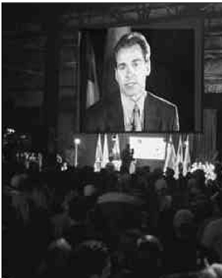
Inside LSU Football with head coach Nick Saban hit the road again in 2001 for the Sugar Bowl with a live telecast from Tipitina's Ruins in downtown New Orleans.