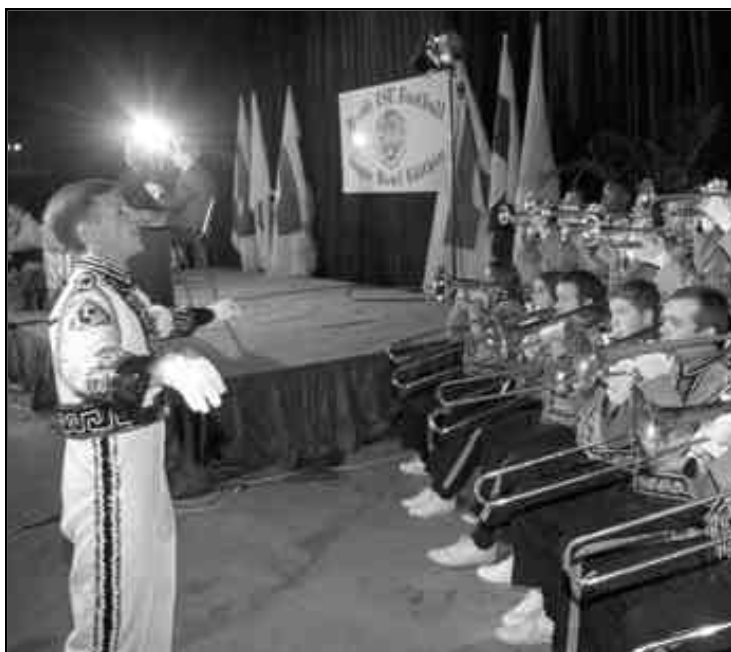
The Golden Band from Tigerland performed for the live audience.

Catch the show in its entirety on LSU's official athletic department web site, LSUsports.tv.