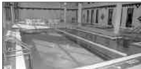
Athletic Training Center