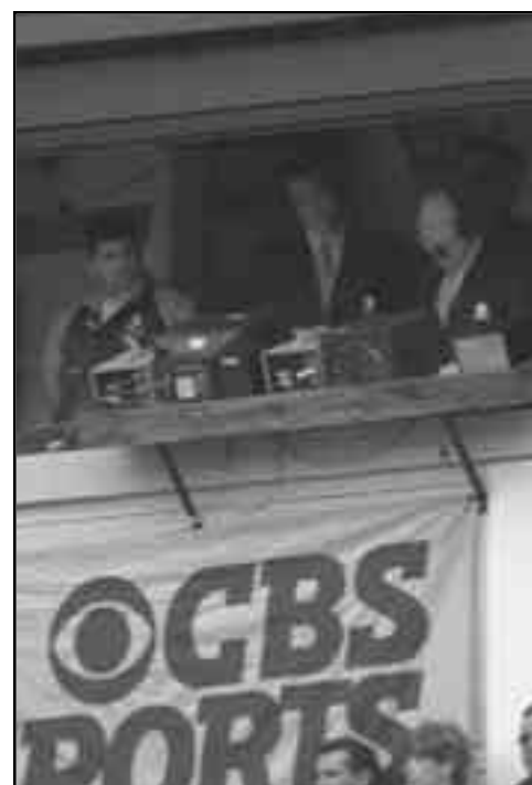
CBS televised four LSU games in 2001.

Prior to joining LSU athletics, the New Orleans native served as photographer for the independent Tiger Rag magazine for five years. Franz was also a photographer for United Press International covering some of the area's major political events, Presidential visits, the New Orleans Saints and the NCAA men's and women's Final Fours in New Orleans.