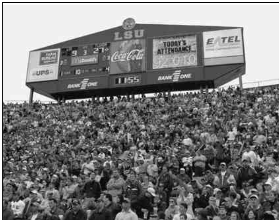
Tiger Stadium features two state-of-the-art multi-million dollar scoreboards that are equipped to show game action as well as instant replays.