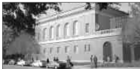
Academic Center for Student-Athletes