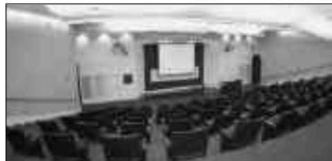
Lawton Squad Room