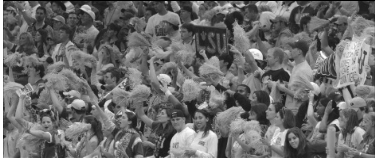
A record I.2 million fans watched LSU athletics in all 20 sports during the 2003-04 athletic season.