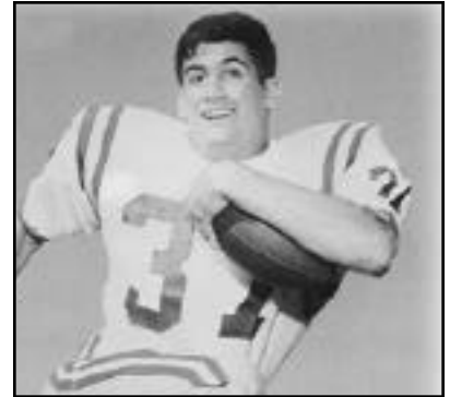
Tommy Casanova was a three-time All-America selection at safety from 1969-71 and is one of 10 former Tigers (5 players, 5 coaches) enshrined in the College Football Hall of Fame.