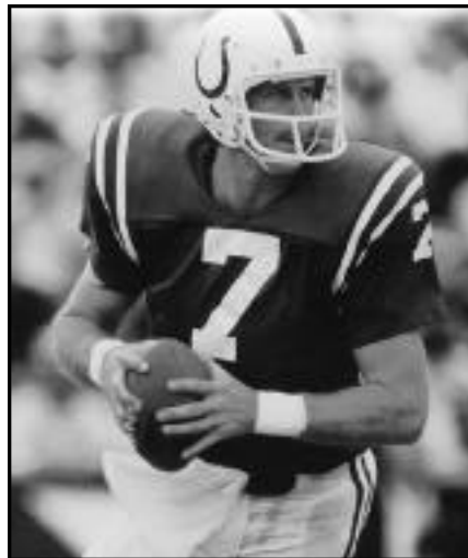
Bert Jones earned All-America honors for LSU in 1972 and he later went on to be an All-Pro quarterback with the Baltimore Colts.