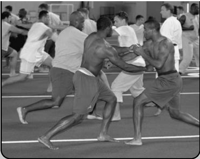
The Tigers work on various karate techniques to help improve agility and flexibility.