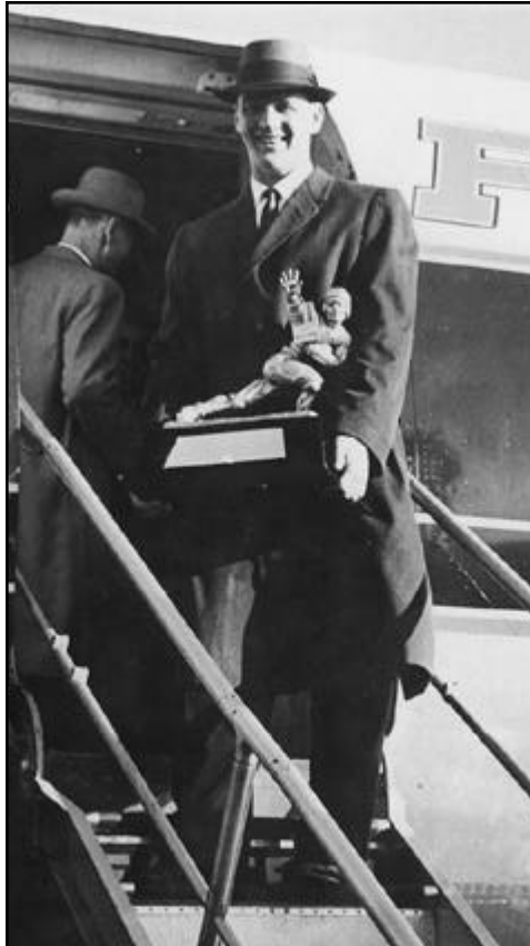
Billy Cannon returns home from New York after winning the Heisman Trophy in 1959