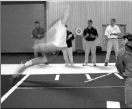
LSU annually has one of the best attended Scout Day's in the nation. NFL scouts and executives get an opportunity to test LSU player's strength, speed, agility and jumping ability in person.