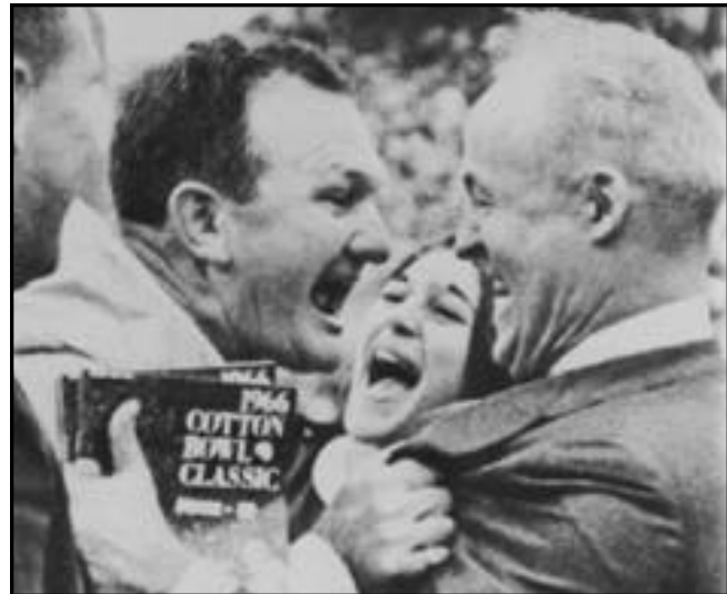
Charles McClendon capped his 18-year career in TigerTown by leading LSU to 13 bowl games, seven of which were victories, including the 1966 Cotton Bowl.