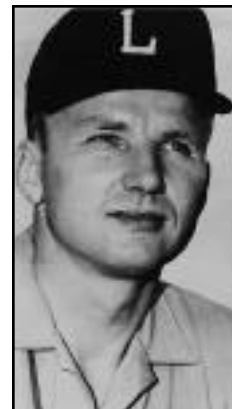
LSU coach Paul Dietzel guided the Tigers to the 1958 national title and as a result he was named National Coach of the Year by the American Football Coaches Association.