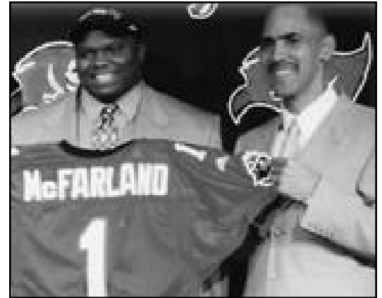
Anthony "Booger" McFarland became LSU's latest first round draft pick when Tampa Bay selected him in the first round in 1999.