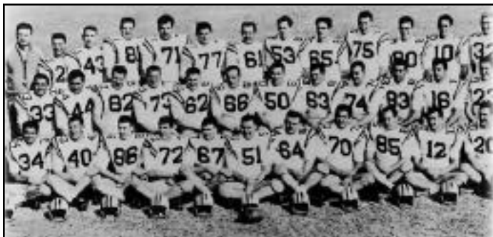
LSU captured its first national title in 1958 as the Tigers rolled to a perfect 11-0 mark while allowing just 53 points all season long.