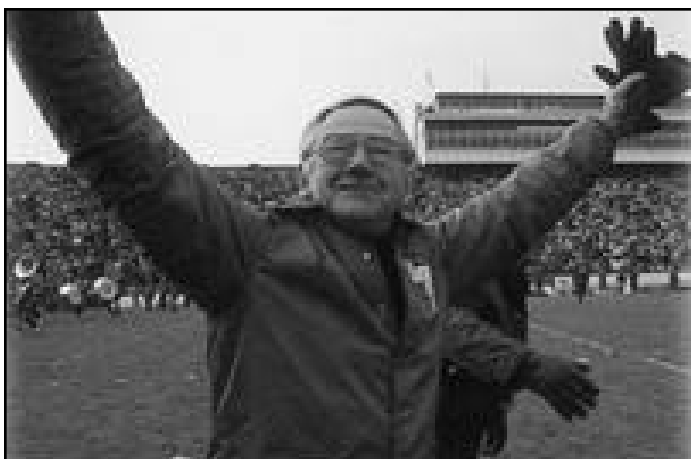
Bill Arnsparger led LSU to the 1986 SEC title and to bowl games in each of his three years as head coach of the Tigers.