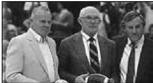
Former LSU greats Steve Van Buren, Y.A. Tittle and Jimmy Taylor are members of the NFL Hall of Fame.