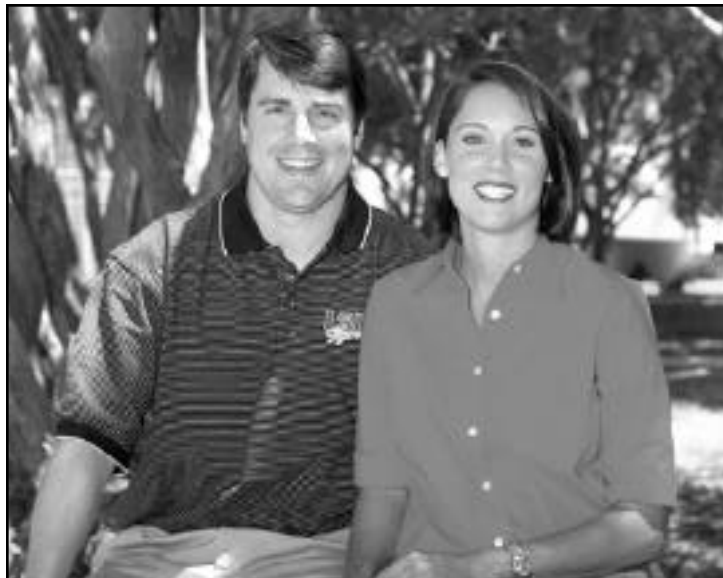
Will and Carol Muschamp