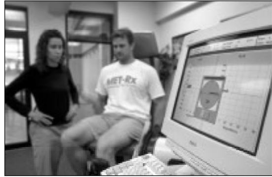
Focused on aggressive rehabilitation, the Broussard Center for Athletic Training is furnished with the latest in technology and equipment.