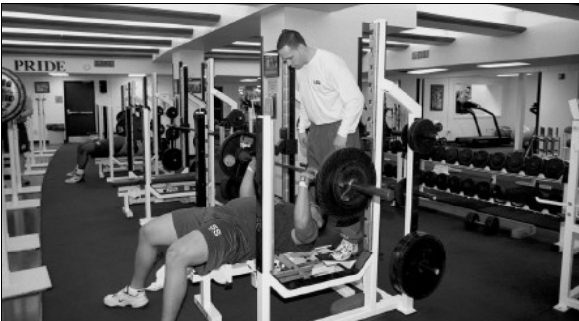
The LSU Strength & Conditioning Facility is located in Tiger Stadium, just a few yards from the LSU Football locker room.

YEAR AT LSU: .....Fourth (Second as full-time) BIRTHDATE: .....Jan. 28, 1976 HOMETOWN: .....Kenner, La. COLLEGE: .....Louisiana-Lafayette '98, POSTGRADUATE: ....LSU '02