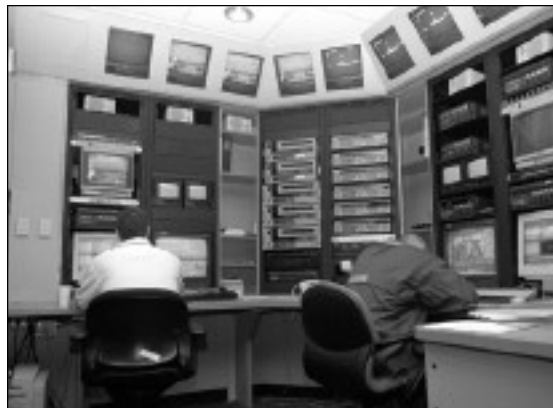
Aucoin and his staff are responsible for taping of games and practices, opponent breakdowns and tape cut-ups used as teaching tools.