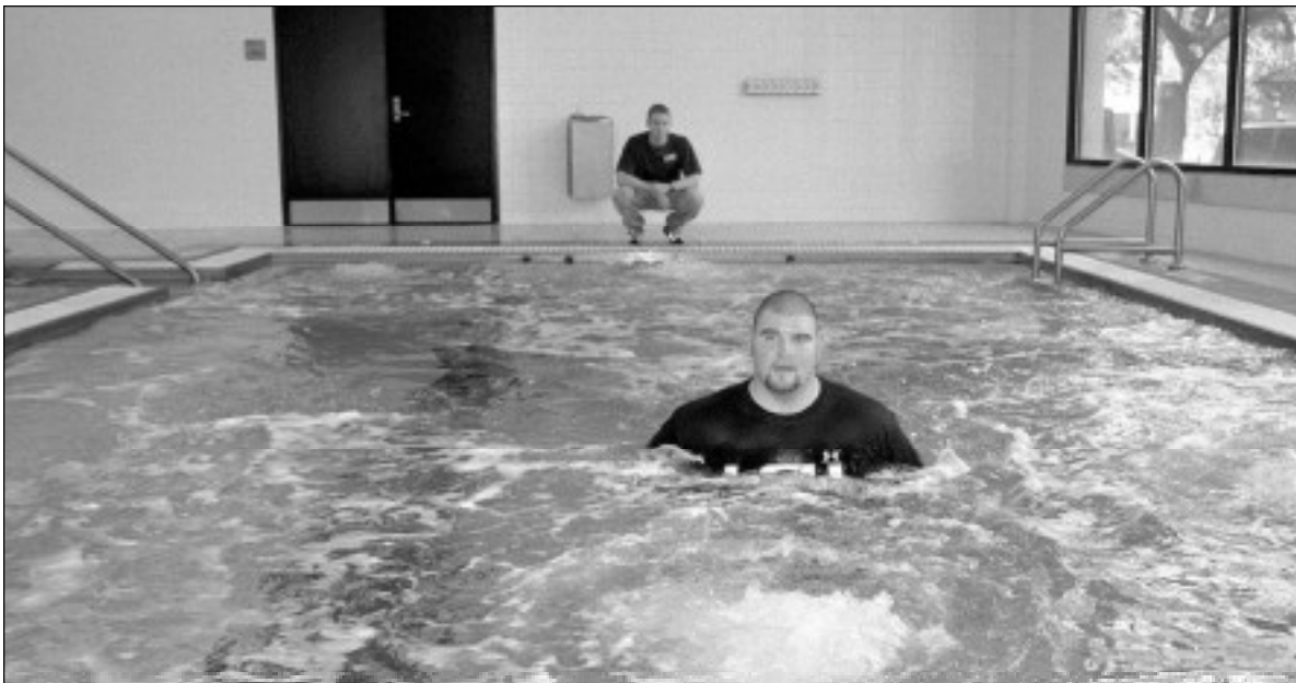
Some of the features of the 23,000-square foot facility include an on-site x-ray room, an in-house pharmacy, as well as state-of-the-art hydrotherapy pools.