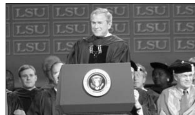
President George W. Bush 2004 LSU SPRING COMMENCEMENT