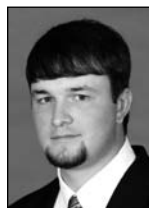
Will Stafford Sports Information Contact