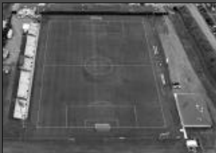
The LSU Soccer Complex comfortably seats 1,500 spectators.