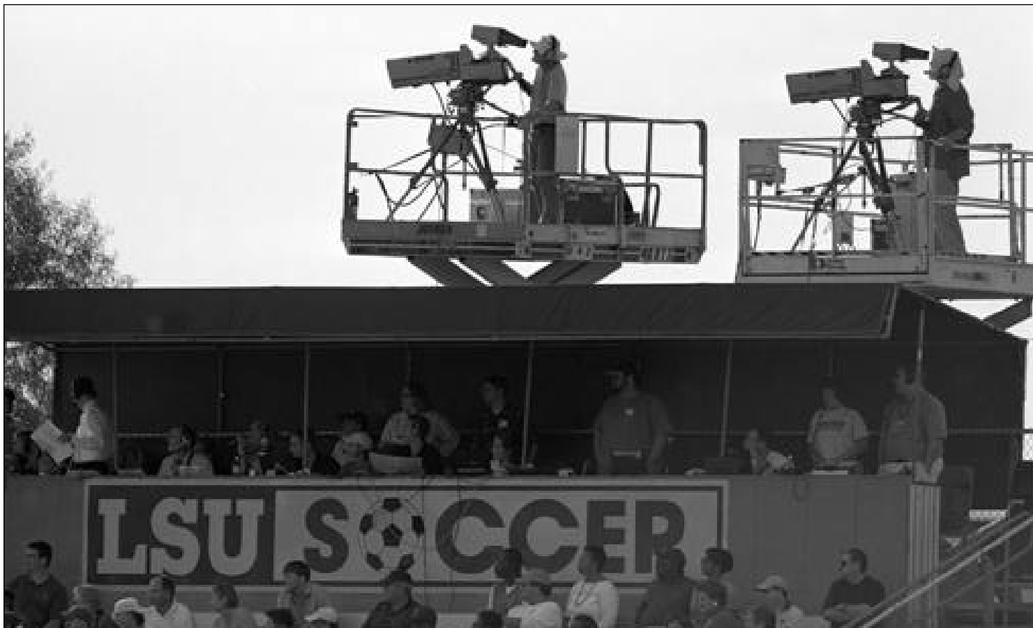
The LSU Soccer Complex during the 2001 SEC Tournament.