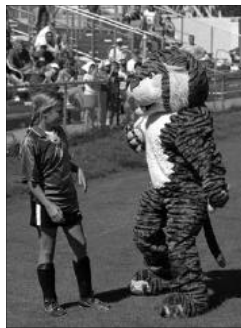
Mike the Tiger greets an anxious LSU fan.