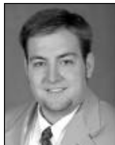
Zac Schrieber Sports Information Contact