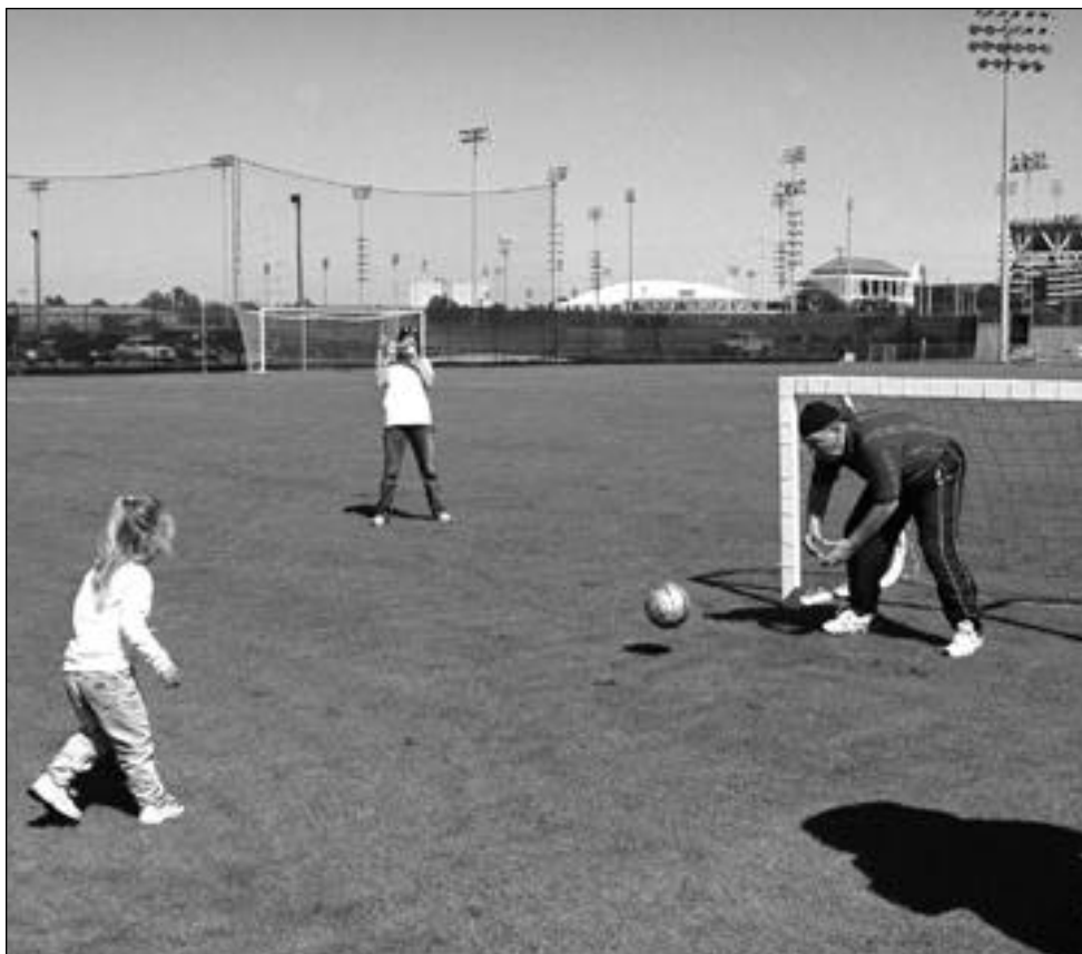
LSU Director of Athletics Skip Bertman defends a goal attempt during a half-time promotion.