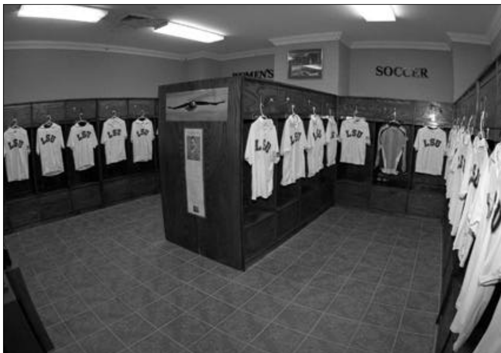
The spacious LSU locker room provides adequate dressing space for more than 30 players.