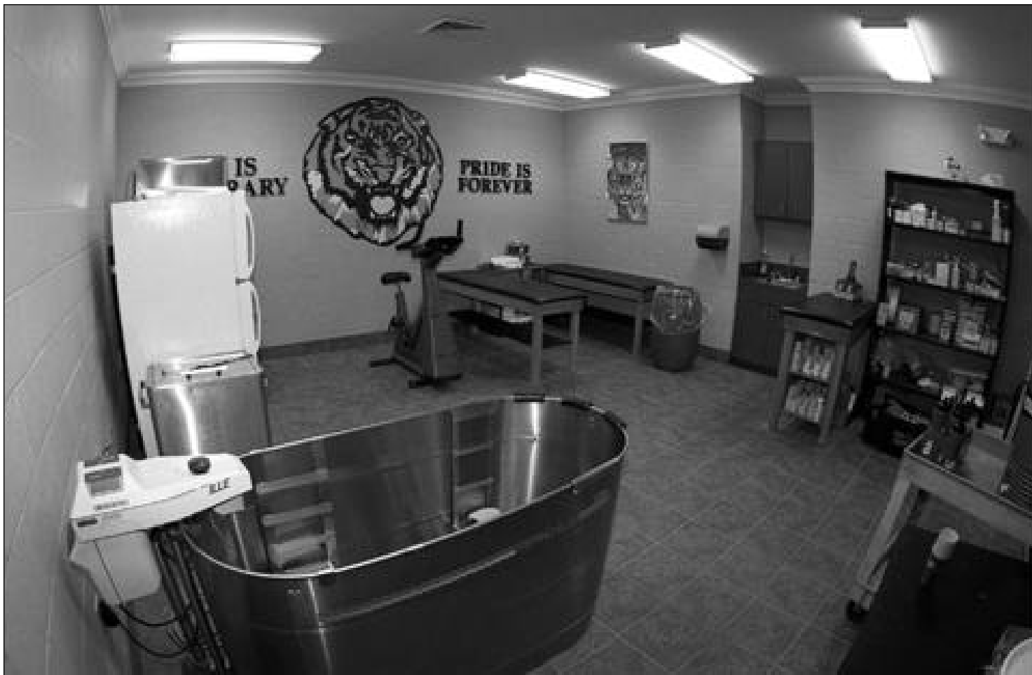
LSU's on-site training facility is complete with taping tables and a whirlpool.