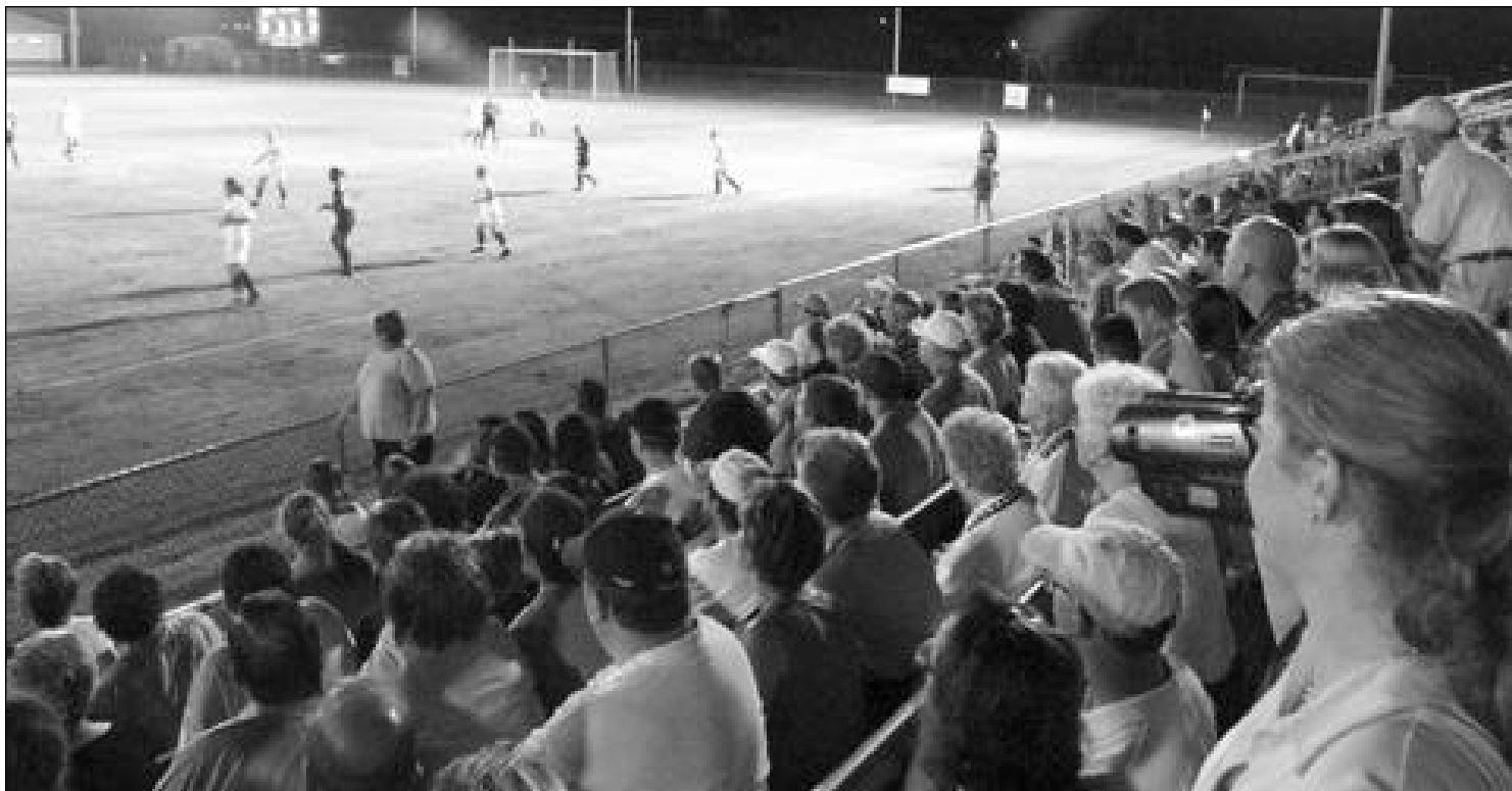
The LSU soccer team recorded the seventh highest attendance in LSU athletics during the 2001 season.