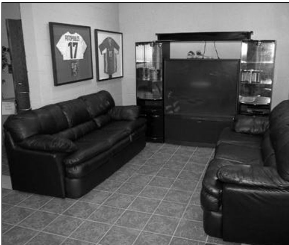
The Tiger Lounge provides the players with a place to unwind and to watch game film.