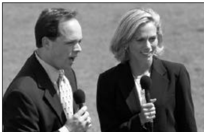
Announcers from FoxSports.net conduct the post-game show after the Tigers' 1-0 win over Arkansas.