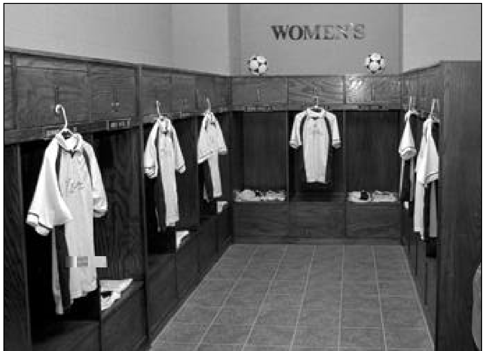
The spacious LSU locker room provides adequate dressing space for more than 30 players.

The LSU soccer program can now boast a modern, spacious, state-of-the-art locker room to call their own. The facility includes locker rooms for both the Tigers and the visiting team, as well as a changing room for the game officials. There is also an on-site training room, a meeting room for the Tigers and an office for the LSU coaching staff.