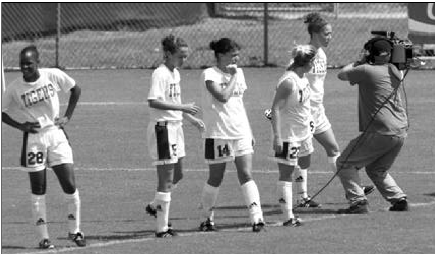
Members of the LSU soccer team get focused prior to one of their televised games.