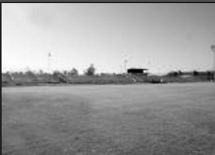
The LSU Soccer Complex comfortably seats 1,500 spectators.

In addition, the stadium features a brand-new scoreboard, a modern sound system and is one of the only facilities in the Southeastern Conference equipped with lights.