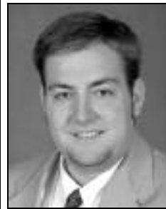
Zac Schrieber Sports Information Contact