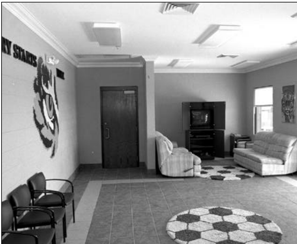
The Tiger Lounge provides the players with a place to unwind and to watch game film.