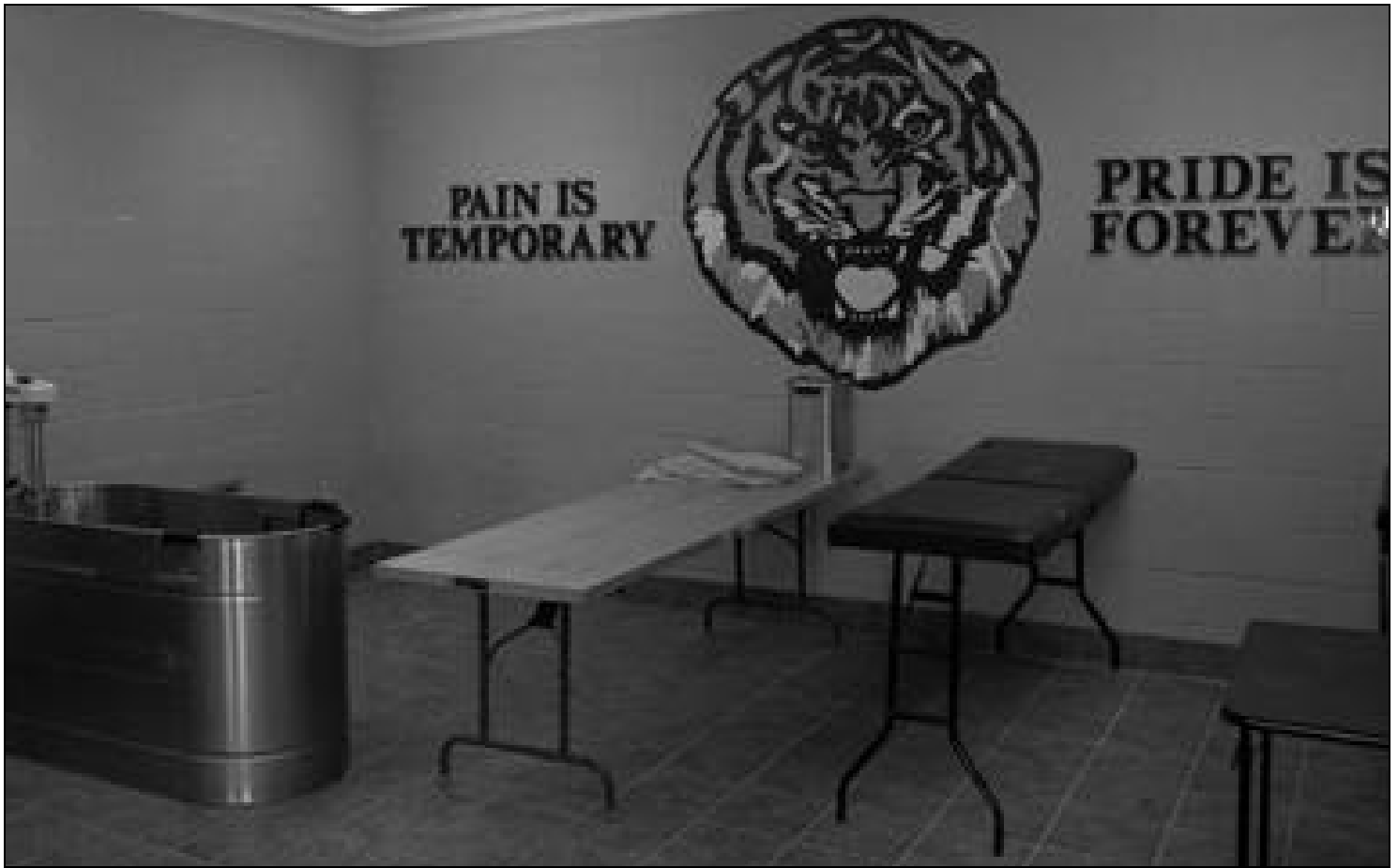
LSU's on-site training facility complete with taping tables and a whirlpool.