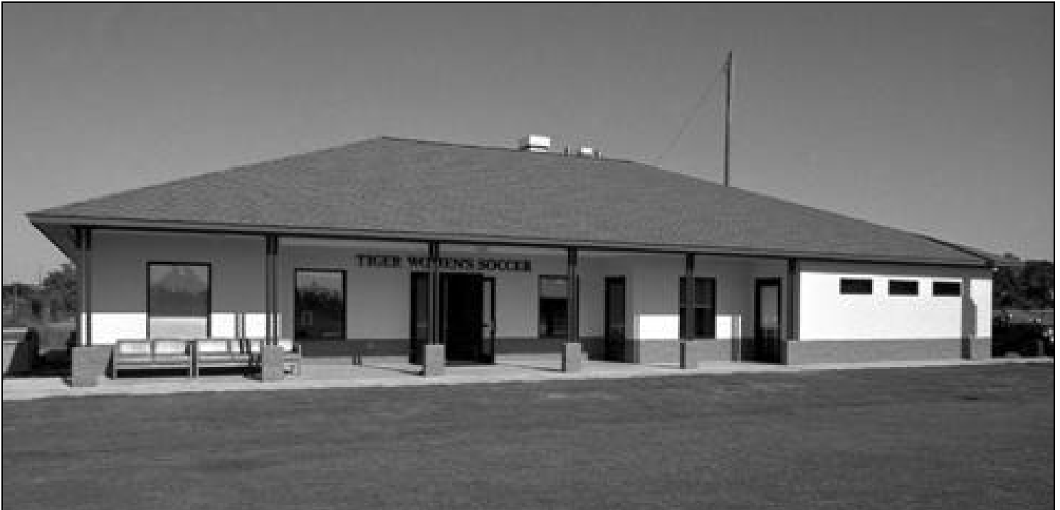
The Tigers' brand new facility houses the locker rooms, offices, as well as an on-site training room.