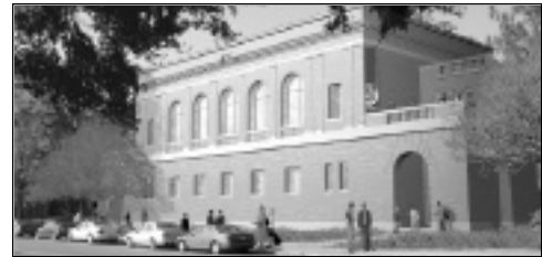
Academic Center for Student-Athletes