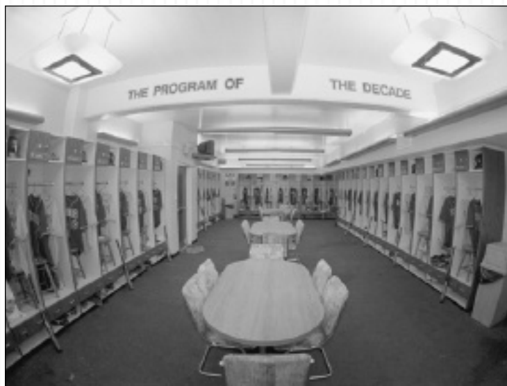
Coaches Committee funds assisted in the renovation of the LSU locker room.