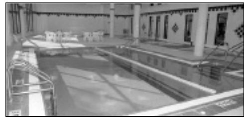
Athletic Training Center