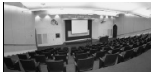
Lawton Squad Room