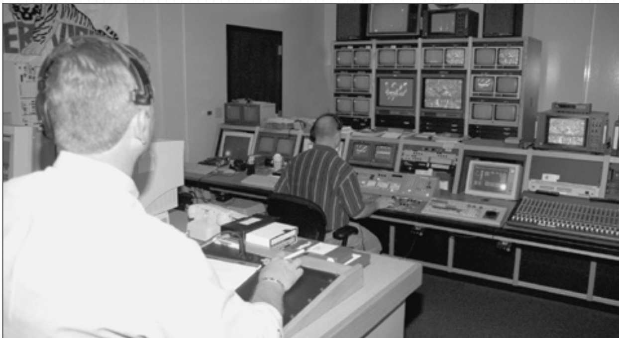
The Athletic Administration building houses a television control room that is used for video scoreboard broadcasts for football, basketball and gymnastics in Tiger Stadium and the Pete Maravich Assembly Center.