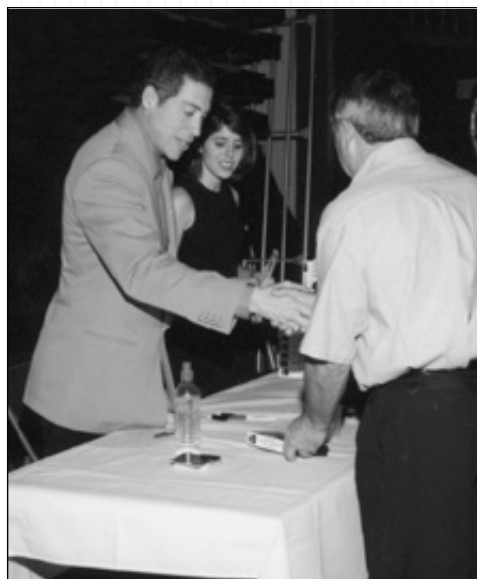
ESPN interviewer and Las Vegas personality Roy Firestone performed his sports-oriented variety show as part of a fund-raiser sponsored by the Coaches Committee on December 11, 1998.