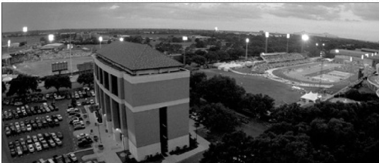
Over a four-day span last spring, the LSU campus served as the host of the NCAA Track and Field Championships as well as an NCAA Baseball Regional.