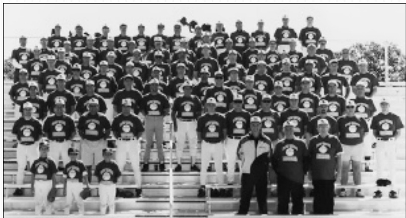
Over 100 former players and coaches participate in the alumni weekend festivities.

All former LSU baseball players, coaches, managers and trainers are encouraged to join the Tiger Baseball Alumni Foundation. For more information, contact the LSU Baseball office at (225) 578-4148.