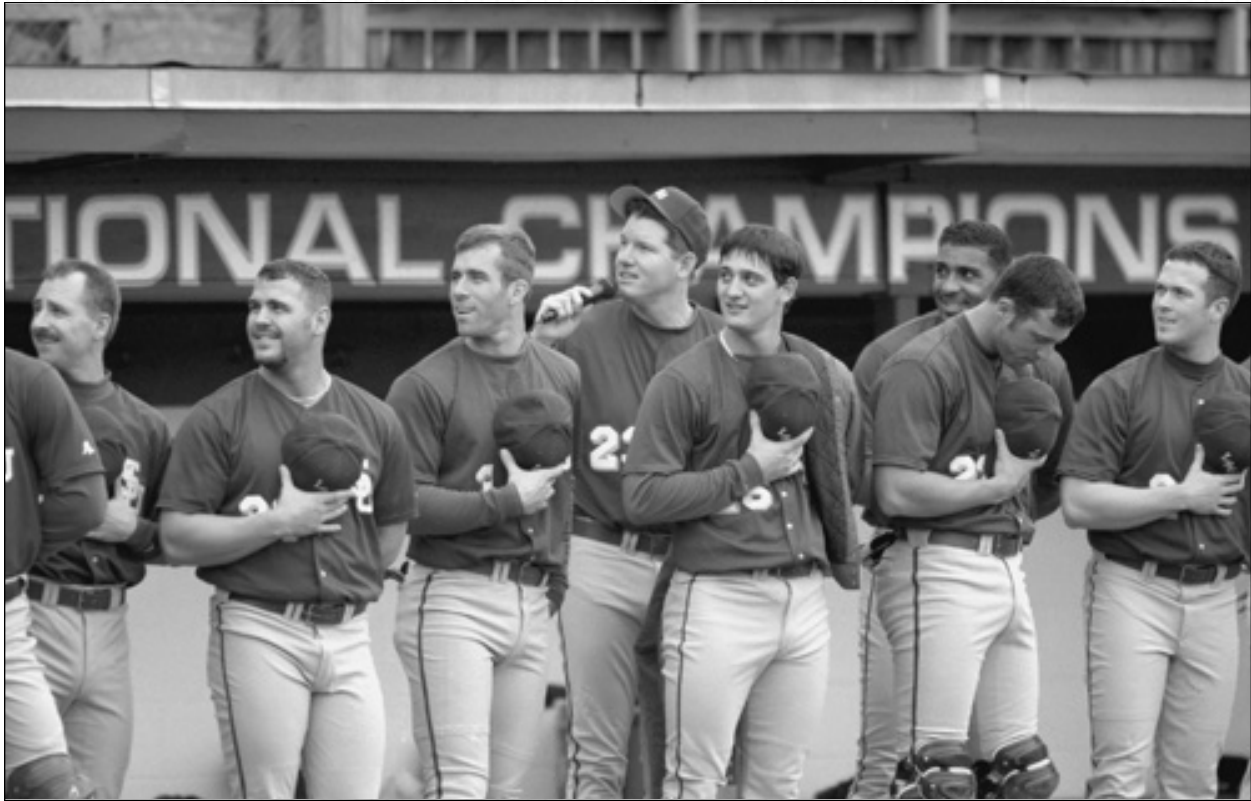
The annual Alumni Game matches the current LSU club versus a team of former Tigers active in pro baseball.

The Tiger Baseball Alumni Foundation is a unique group of former players, coaches, trainers and team managers who work year-round in organizing functions for alumni of the LSU Baseball program. The TBAF is the only one of its kind in the country involved with a college baseball program. The long-term purpose of the foundation can best be described by its mission statement: