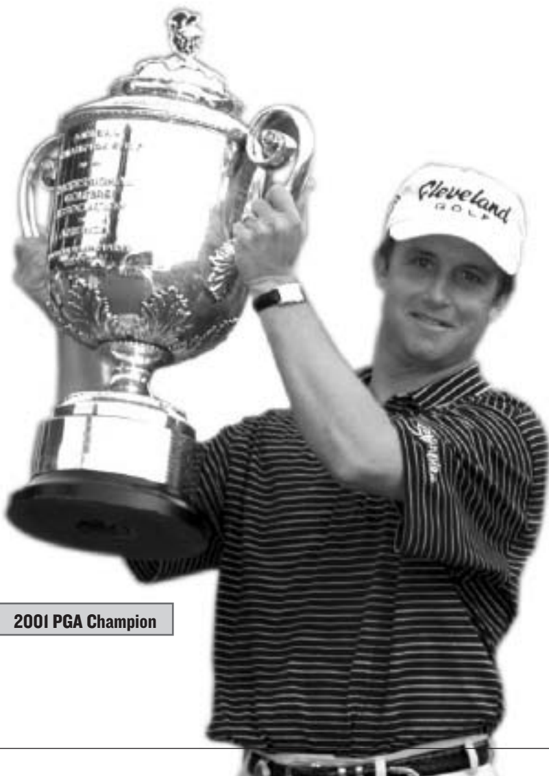
2001 PGA Champion