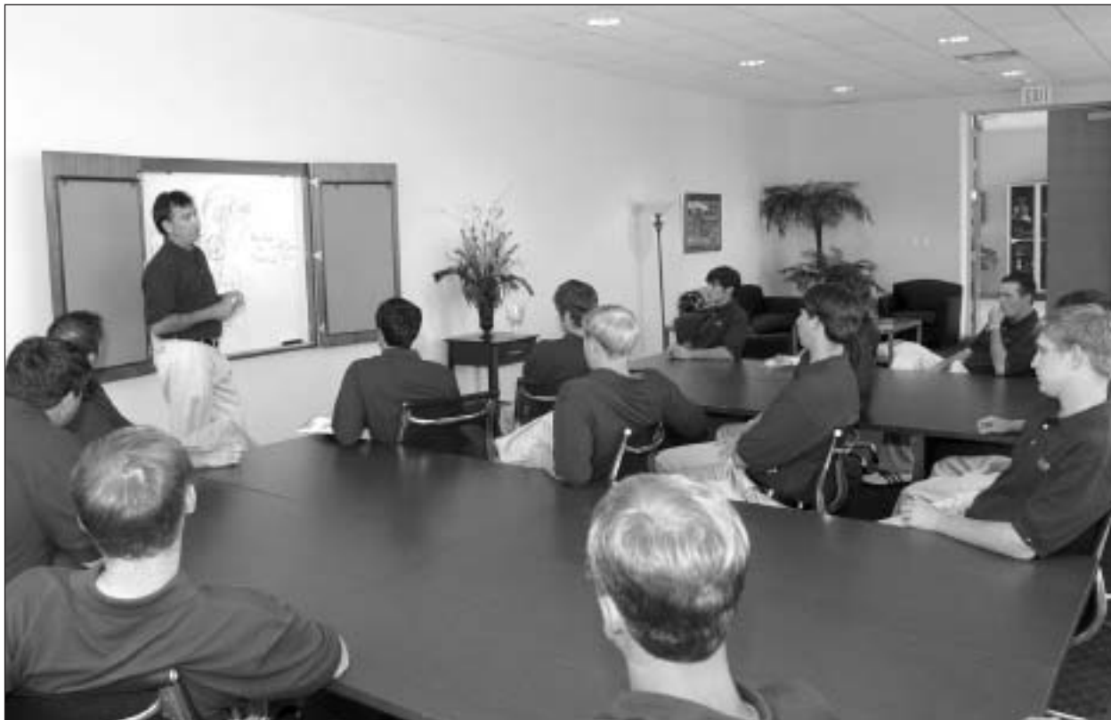
The lavish conference room at the U-Club enables the LSU coaching staff and players to meet in a quiet, spacious area.