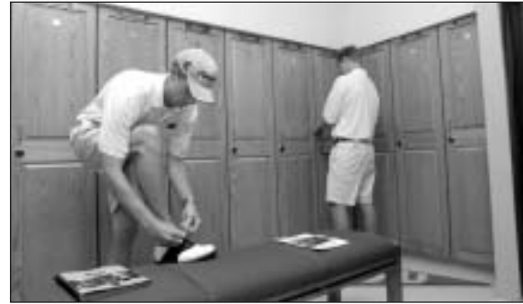
The new lockerroom includes space for all the Tigers to dress and store their equipment.