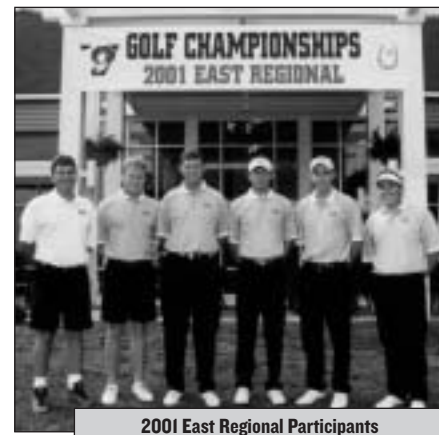
2001 East Regional Participants