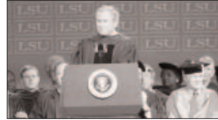
President George W. Bush 2004 LSU SPRING COMMENCEMENT

“LOUISIANA STATE UNIVERSITY HAS A TRADITION OF GRATITUDE EXPRESSED IN SERVICE TO COMMUNITY AND COUNTRY.”