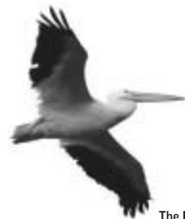
The East Brown Pelican is Louisiana's State Bird.

L ouisiana, one of America's most culturally and geographically diverse states, is located in the heart of the Deep South. Adjacent to the Gulf of Mexico and dotted with hundreds of lakes and bayous, Louisiana is home to all types of terrain from swamps and marshes to lush forests and gentle hills. The state is known for its charm and friendly people, and still maintains the stately antebellum plantations and majestic oaks of its early days. The atmosphere is elegant, yet relaxed and casual.