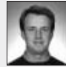
DAVID TOMS 2001 PGA CHAMPION AND LSU GRADUATE

“As far back as I can remember (riding bicycles, playing little league baseball), I have literally bled purple and gold. It never crossed my mind that there was anywhere else to go other than LSU. The experiences and relationships that I developed at LSU have been an integral part of my life. No other colleges existed in my mind. I am fortunate to have attended a place that I considered a dream and look forward to my association with the university until the day I die.”