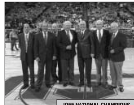
1955 NATIONAL CHAMPIONS