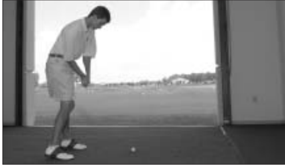
The new practice facility at the University Club includes an indoor hitting bay.