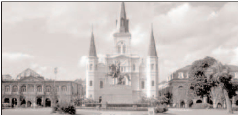
Jackson Square is the heart of the French Quarter in Downtown New Orleans.

Louisiana offers some of the finest hunting, fishing and boating opportunities in the country.