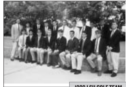
1989 LSU GOLF TEAM