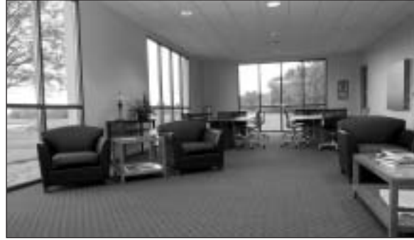
An inside view of the luxurious meeting and conference room.