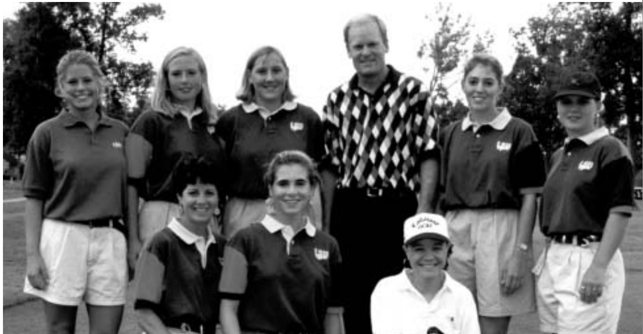
1995-1996 Eighth Place NCAA team with PGA star Johnny Miller.