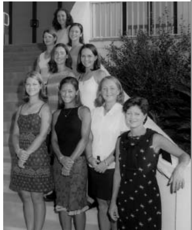
2000-2001 12th Place NCAA Championships