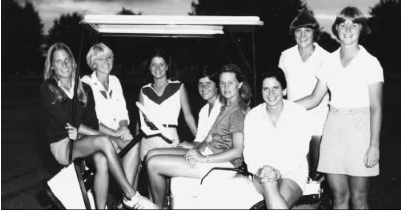
1979-1980 LSU's First Women's Golf Team