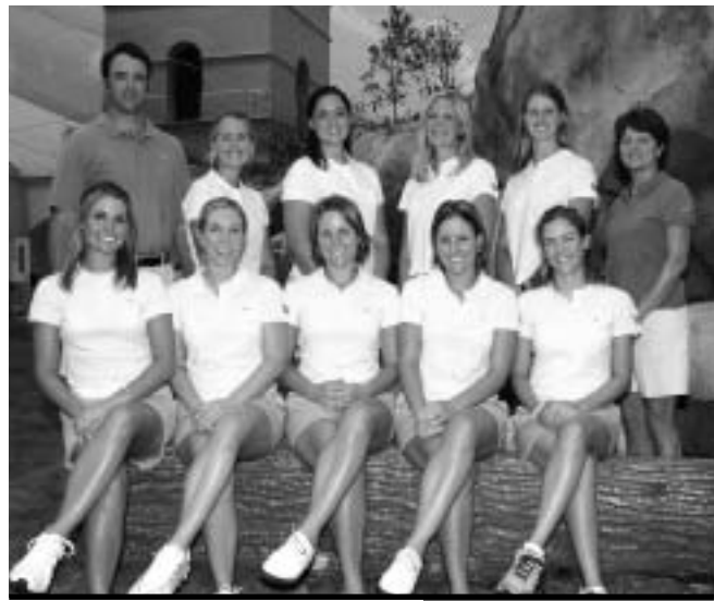
2005-2006 23rd Place NCAA Championships