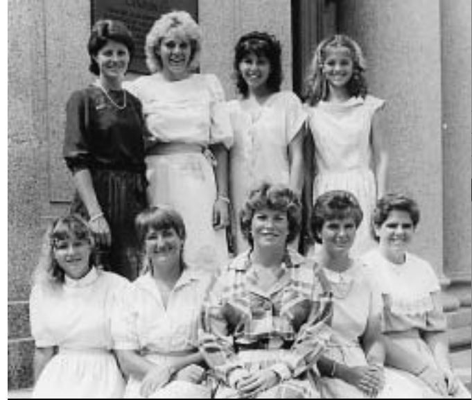
1985-1986 Ninth Place NCAA Championships