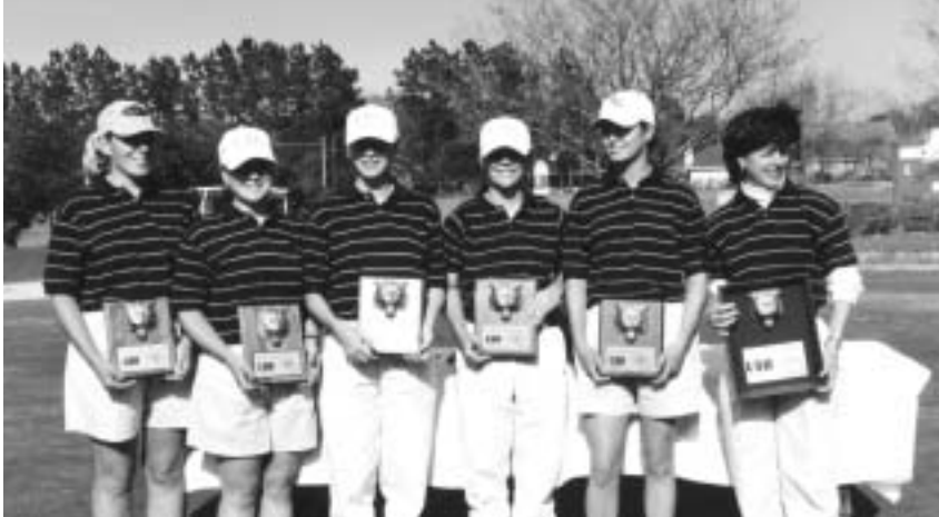
1998 Fairwood Invitational Team Champions