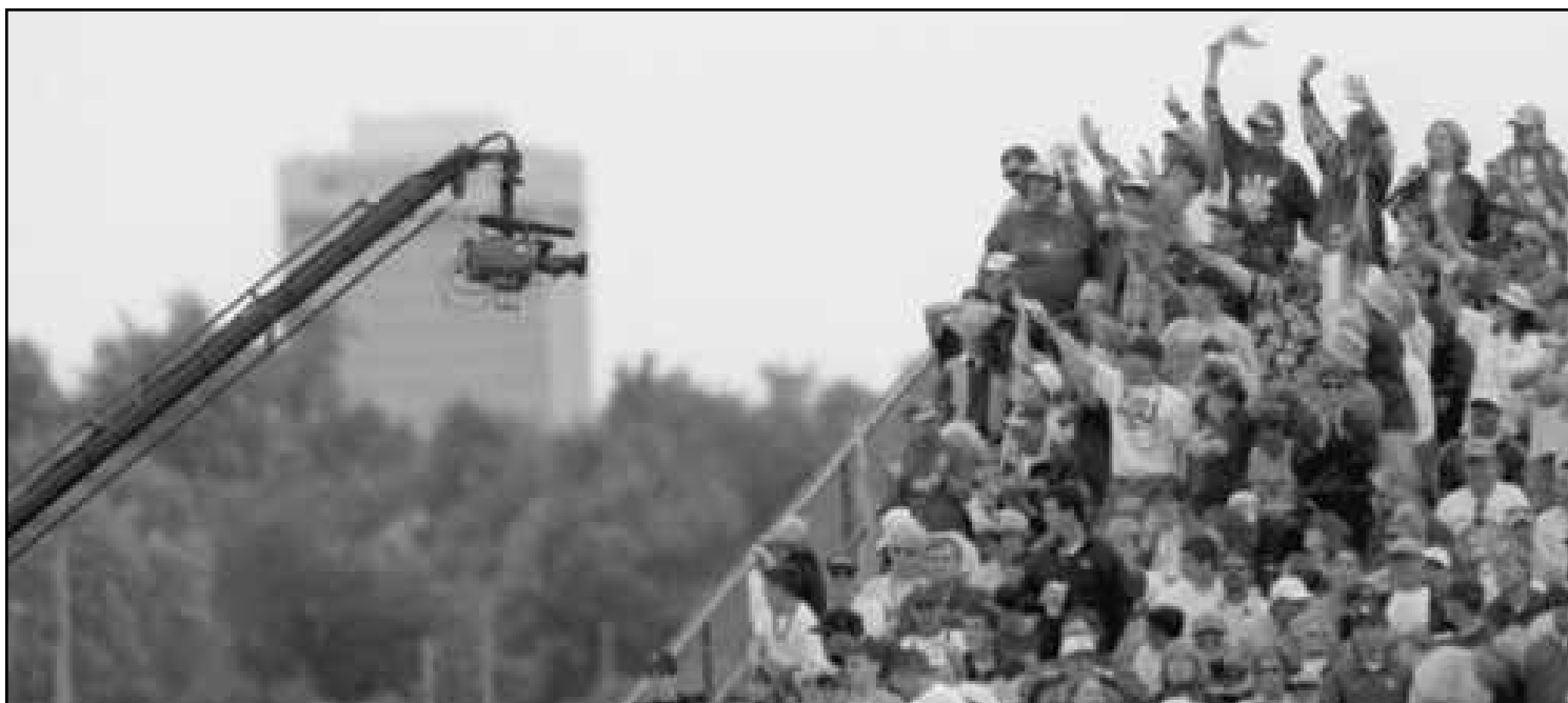
LSU fans respond to the ESPN mobile camera in Rosenblatt Stadium during the 2000 College World Series.

^ - College World Series * - SEC Tournament # - NCAA Regional % - NCAA Super Regional