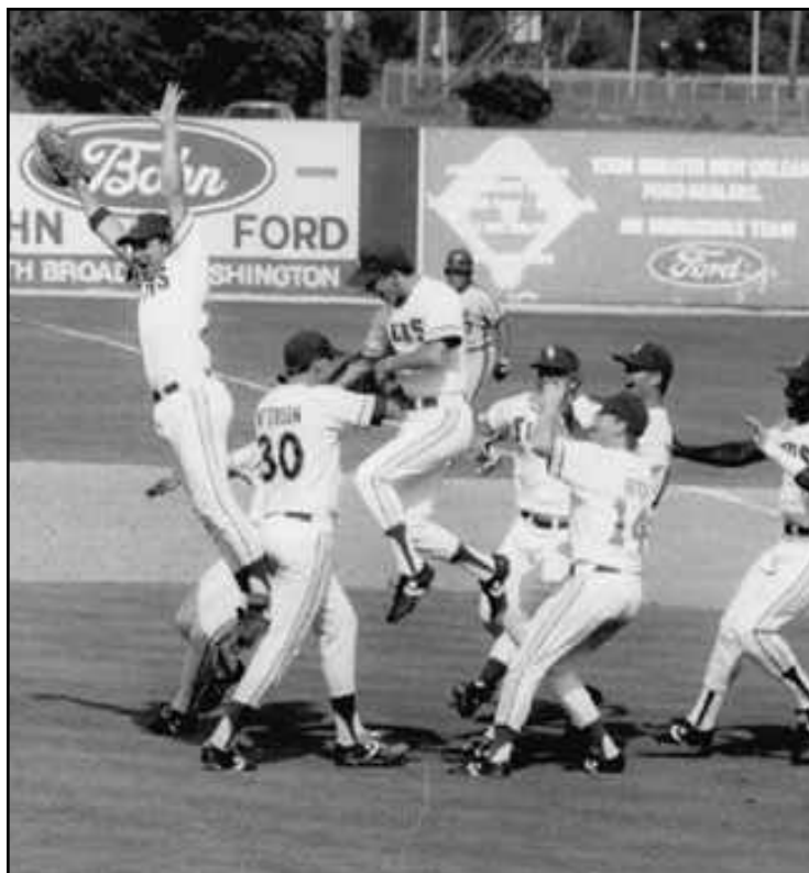
The 1987 Tigers became the first SEC team to make back-to-back CWS trips.