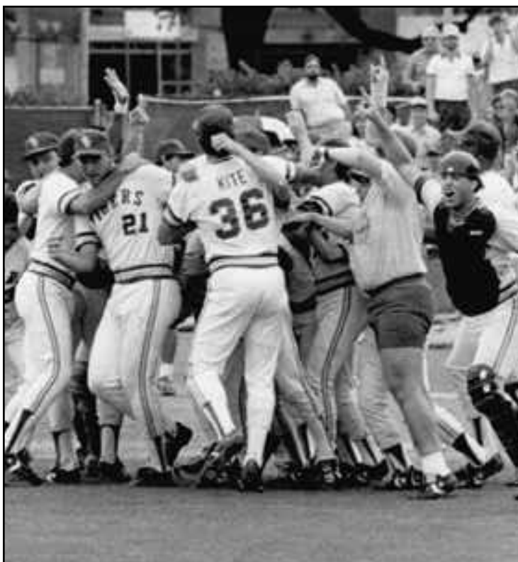
The 1986 Tigers earned LSU's first College World Series berth.