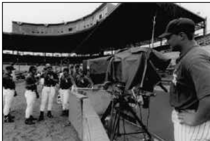
The Tigers check out the CBS equipment prior to the 1993 national championship game.