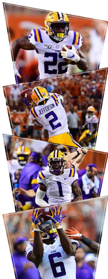
CLYDE EDWARDS- HELAIRE