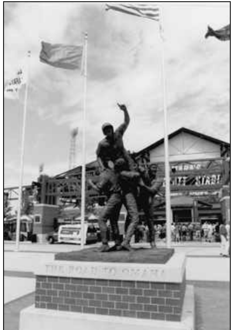
An LSU flag flies above the entrance to Omaha's Rosenblatt Stadium.