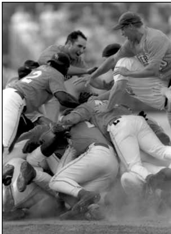
LSU played host to and won both a 2000 NCAA Regional and Super Regional.