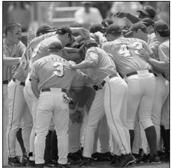
The Tigers are seeking LSU's 13th SEC Championship.