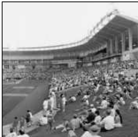
The 2002 SEC Tournament will be held at Birmingham's Hoover Metropolitan Stadium.