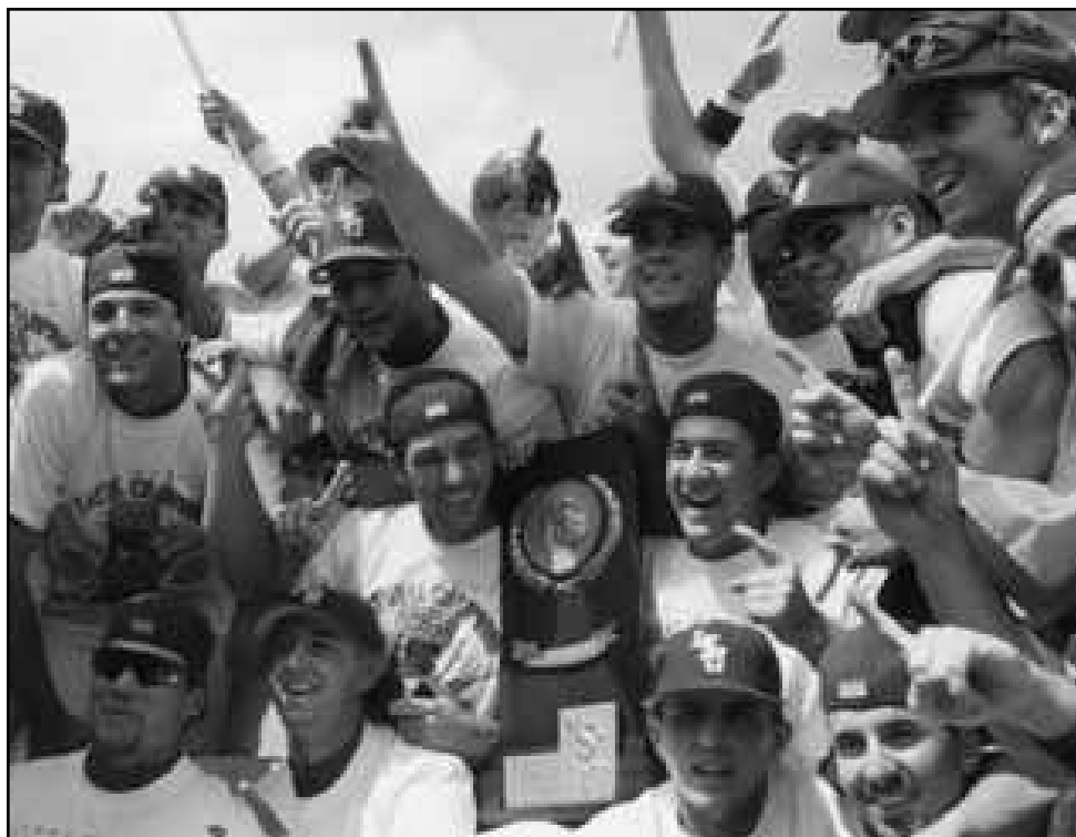
LSU has the highest all-time NCAA Tournament winning percentage (90-31. .744).