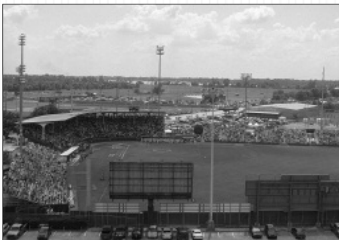
Alex Box Stadium played host to 284,328 fans in 2004, as LSU claimed the NCAA attendance title for the ninth straight season.