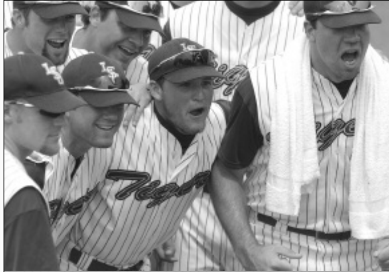
The 2004 Tigers earned LSU's second straight CWS appearance and the school's 13th trip to Omaha in 19 seasons.

The Tigers lost consecutive games in the '04 CWS to Miami (Fla.) and South Carolina to finish in a tie for seventh place. LSU has a 29-17 (.630) cumulative CWS record, the fourth-highest winning percentage in Series annals.