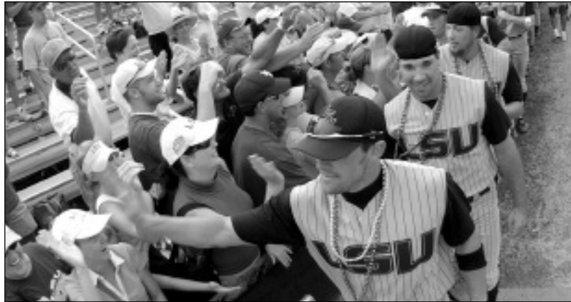
The Tigers celebrate with the Alex Box Stadium fans after defeating Texas A&M in the NCAA Super Regional.