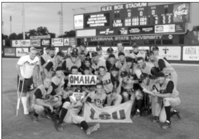
The 2004 Tigers swept two games from Texas A&M to win the NCAA Super Regional and advance to the College World Series.