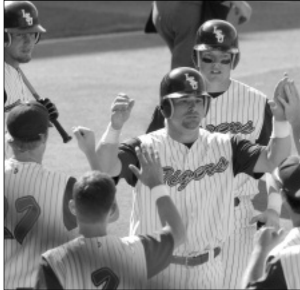
The Tigers led the SEC in 2004 with a .333 team batting average.

& - Overall SEC Co-Champions # - Eastern Division Champions % - Western Division Champions @ - SEC Tournament Champions