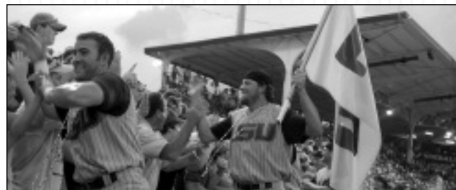
LSU played host to and won both a 2004 NCAA Regional and Super Regional.

In 2004, LSU played host to and won both an NCAA Regional and Super Regional to advance to the College World Series for the 13th time in school history. LSU is one of only 10 schools to have earned at least 13 CWS berths.