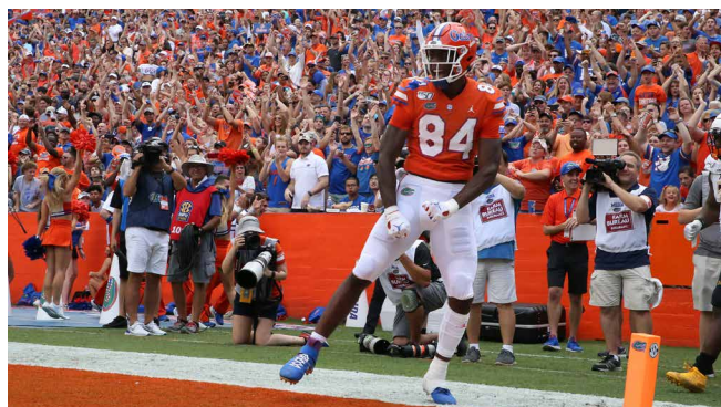
Kyle Pitts continued his hot streak with four receptions -- two of which were for touchdowns.