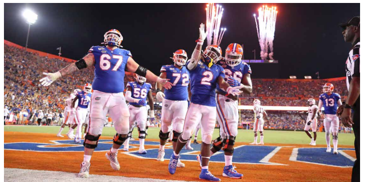
Florida's offense set off plenty of fireworks in their home opener, which led to its first six-game winning streak since 2015.