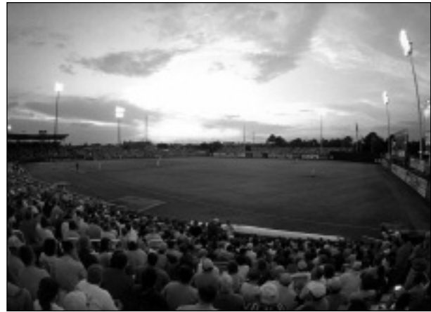
LSU drew an NCAA-record 291,676 fans to Alex Box Stadium in 2003.