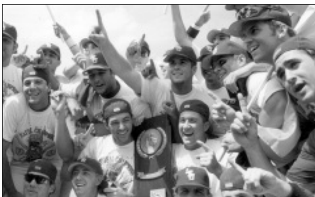
LSU has the highest all-time NCAA Tournament winning percentage (99-37, .728).