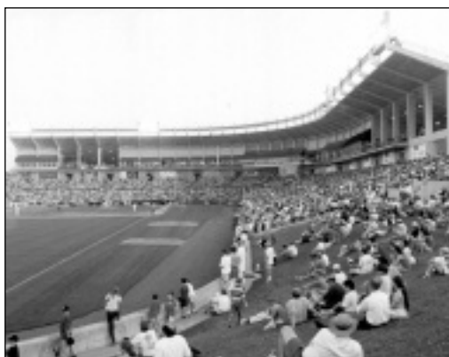
The 2004 SEC Tournament will be held at Birmingham's Hoover Metropolitan Stadium.