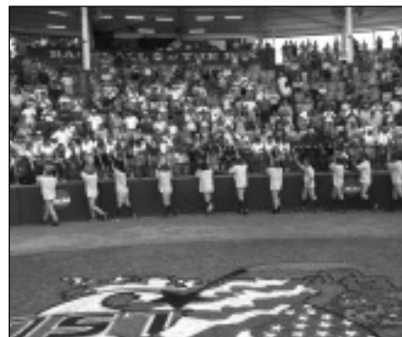
LSU played host to and won both a 2003 NCAA Regional and Super Regional.

In 2003, the fifth season played under the 64-team format, LSU played host to and won both an NCAA Regional and Super Regional to advance to the College World Series for the 12th time in school history. LSU is one of only 10 schools to have earned at least 12 CWS berths.