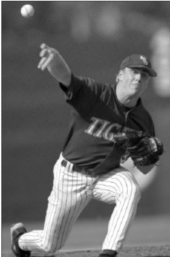
Pitcher Brian Wilson