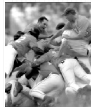
LSU played host to and won both a 2000 NCAA Regional and Super Regional.