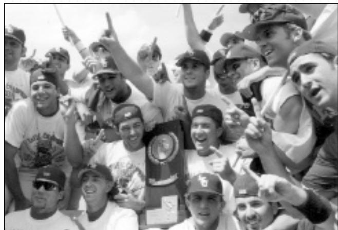
LSU has the highest all-time NCAA Tournament winning percentage (94-34, .734).