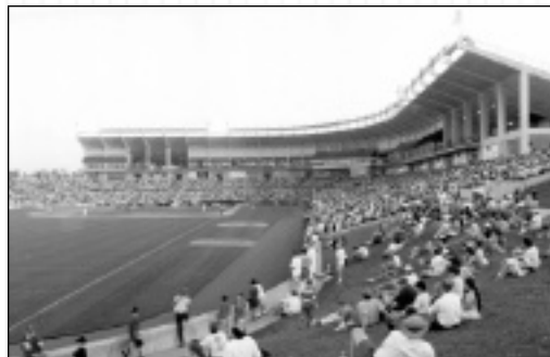
The 2003 SEC Tournament will be held at Birmingham's Hoover Metropolitan Stadium.

LSU posted a 2-2 mark at the 2002 SEC Tournament, dropping a 5-4 decision to South Carolina in the semi-finals. In reaching the "Final Four" of the event, the Tigers kept alive a 17-year streak of winning at least one game in the SEC Tournament. Skip Bertman's LSU clubs won six tournament titles (1986, '90, '92, '93, '94 and 2000) and finished as runners-up on five occasions (1987, '91, '95, '97 and 2001).