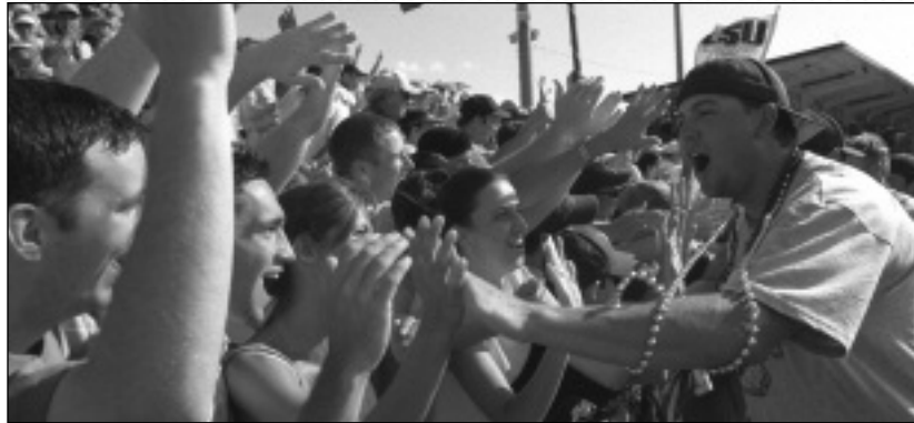
The celebration begins at Alex Box Stadium after LSU defeated Baylor in the NCAA Super Regional.