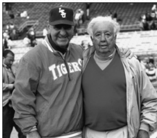
The only men to win five College World Series titles: LSU's Skip Bertman and former Southern California coach Rod Dedeaux.