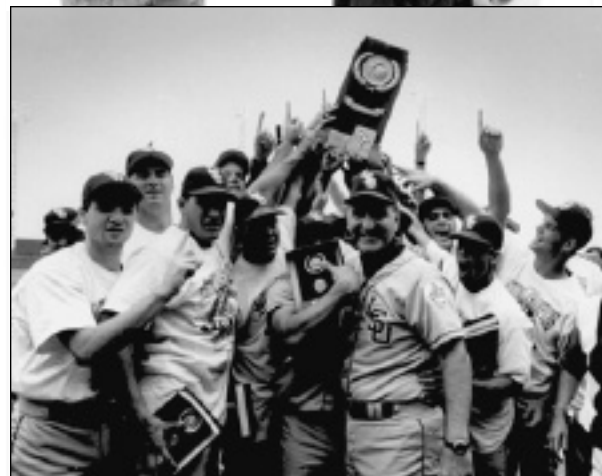
Skip Bertman celebrates his first national title in 1991 (above) and his fifth national title in 2000 (below).

Bertman coached 17 other major leaguers during his LSU tenure, including All-Star outfielder Albert Belle and the No. 1 pick in the 1989 draft, pitcher Ben McDonald.