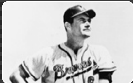
Joe Bill Adcock enjoyed a 17-year big league career.