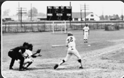
Venerable Alex Box Stadium has served as the Tigers' home since 1938.