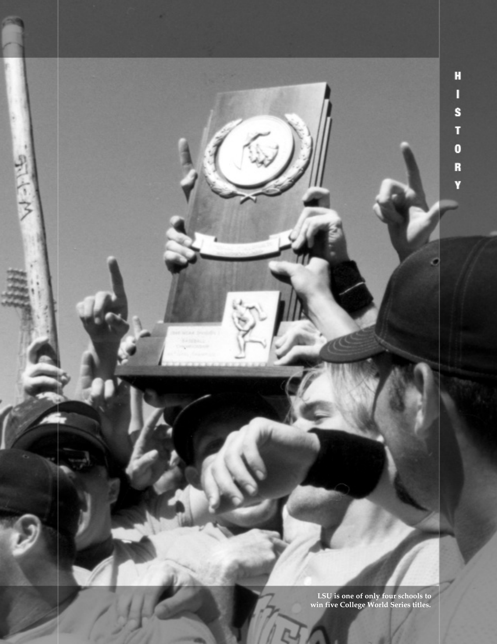
LSU is one of only four schools to win five College World Series titles.