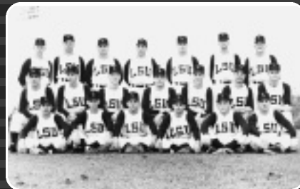
LSU's 1961 SEC Champions