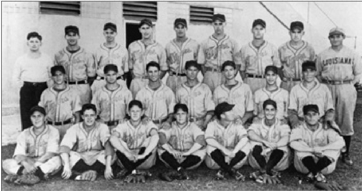
LSU's 1939 SEC Champions