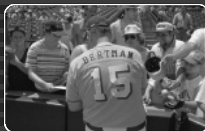
Skip Bertman's LSU program was characterized not only by winning championships, but also by its accessibility and courtesy to Tiger fans.