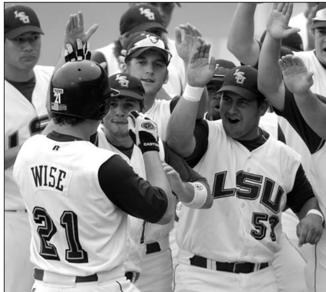
The 2006 Tigers qualified for the SEC Tournament with a 13-17 league record, marking LSU's 22nd consecutive appearance in the event.