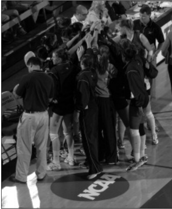
After earning a share of the SEC Western Division title, the 2005 Tigers advanced to the NCAA Regional Tournament in Austin, Texas.