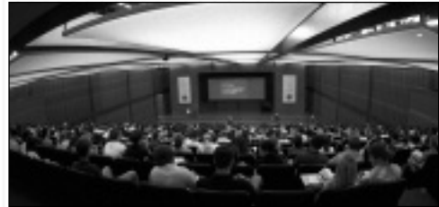
Academic Center for Student-Athletes