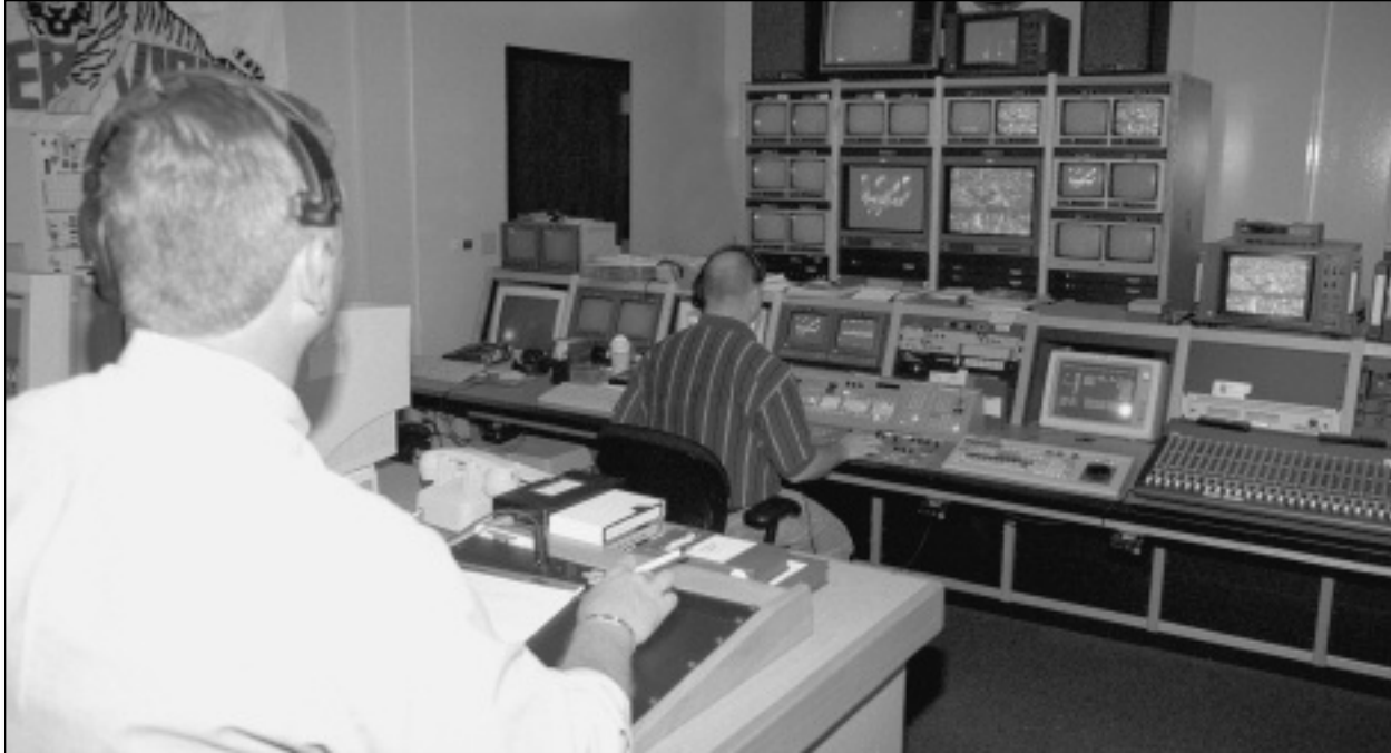
The Athletics Administration building houses a television control room that is used for video scoreboard broadcasts for football, basketball and gymnastics in Tiger Stadium and the Pete Maravich Assembly Center.