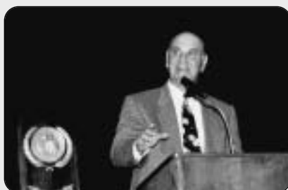
Skip Bertman was named LSU's athletics director on January 19, 2001.

Skip Bertman was inducted July 4, 2006 into the College Baseball Hall of Fame in Lubbock, Texas. Bertman was one of 10 members of the Hall's first class.