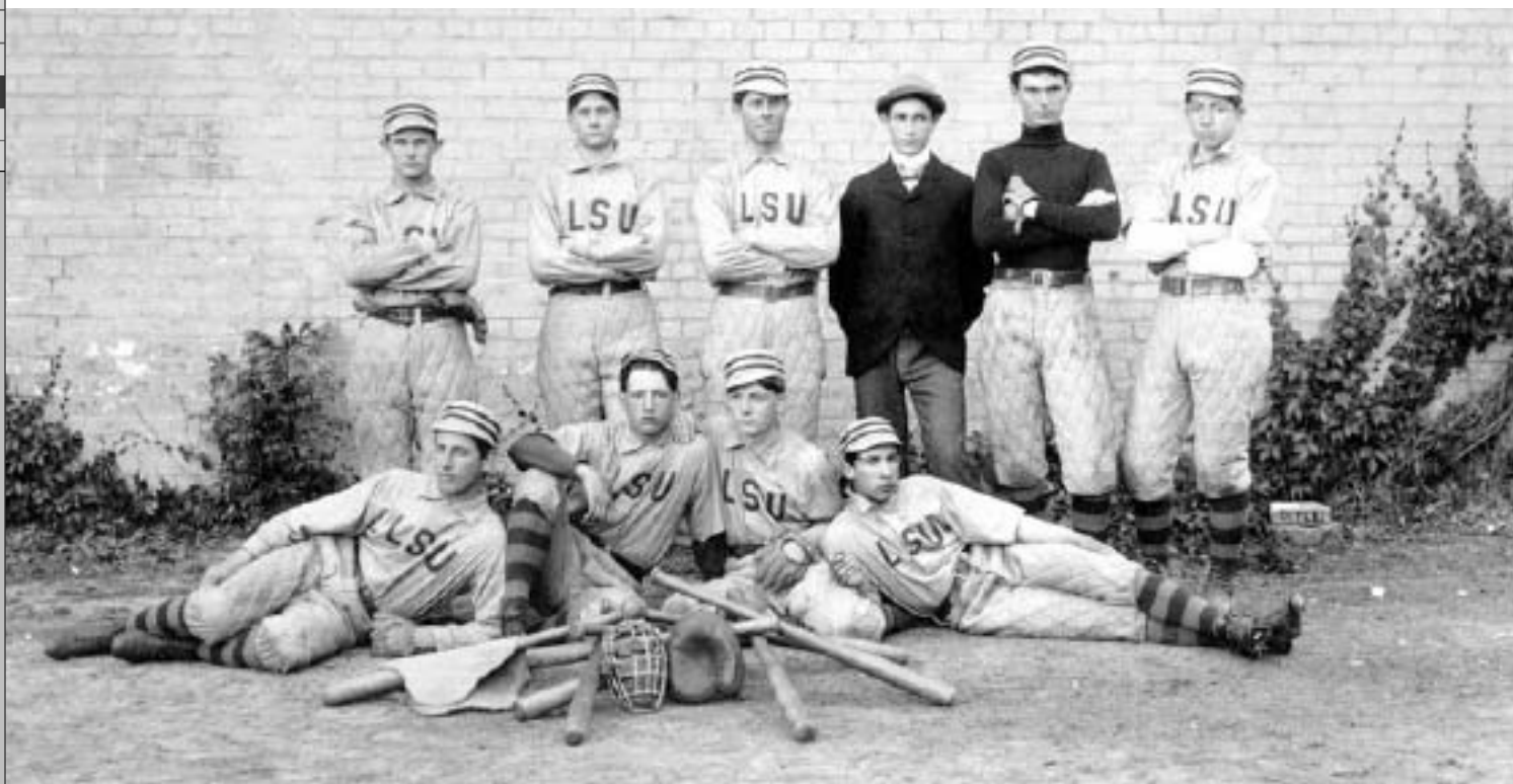
LSU's 1900 Baseball Team

Louisiana State University has a colorful 115-year (112 seasons) baseball history which began with the first team in 1893 and has continued uninterrupted since 1905.