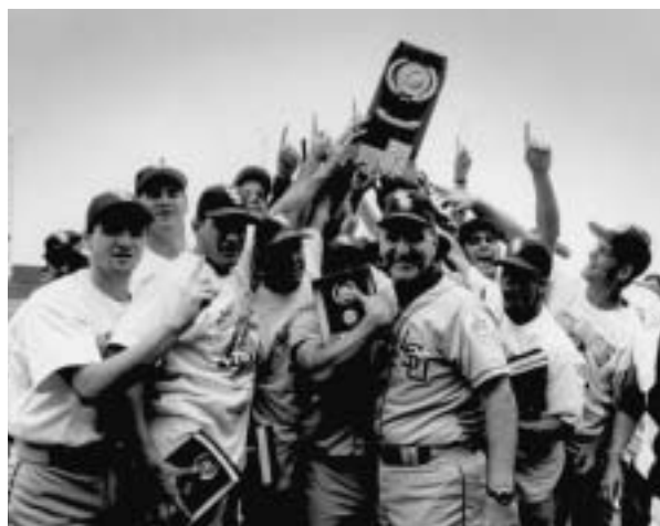
Skip Bertman celebrates his first national title in 1991 (above) and his fifth national title in 2000 (below).