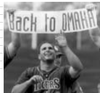
LSU has made 13 CWS appearances since 1986.