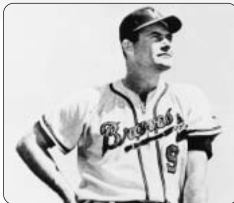
Joe Bill Adcock enjoyed a 17-year big league career.

Those and other outstanding players performed on a number of diamonds on the LSU campus. In 1929, the Tigers' home games were