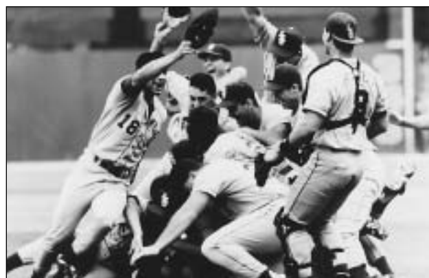
LSU outscored its four CWS opponents, 48-15.