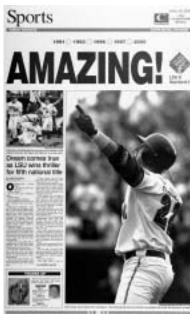
The June 18, 2000, headline of the Baton Rouge Sunday Advocate heralds LSU's CWS title.