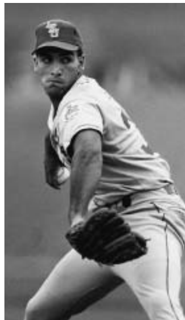
All-American Chad Ogea pitched the Tigers to victory in the CWS final against Wichita State.