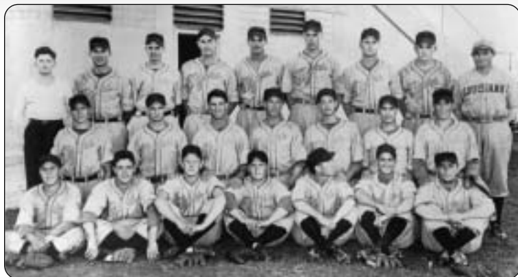
1939 SEC Champions

LSU coaches in the early years supplemented their collegiate schedules with competition against professional opponents. This gave the Tigers excellent chances to gain experience, but rare chances for victory. Among the Tigers' most noteworthy losses was a 17-7 defeat at the hands of the Chicago White Sox in 1925. Other pro opponents included the Detroit, Cleveland, New York and St. Louis major league teams, Indianapolis of the American Association, Nashville and New Orleans of the Southern Association, plus several teams from Louisiana's celebrated Class "C" Evangeline League.