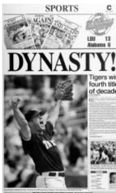
The June 13, 1997, headline of the Baton Rouge Advocate heralds LSU's fourth CWS title.

Prior to the win over Alabama, the Tigers posted CWS victories over Rice (5-4) and Stanford (10-5 and 13-9). LSU batted .328 (45-for-137) in the Series with seven doubles and 10 home runs. The Tigers averaged better than 10 runs per game in the CWS, outscoring their opponents, 41-24.