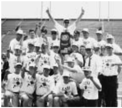
(left) The 1993 National Champions were honored with a celebration in Tiger Stadium the morning after the CWS triumph.