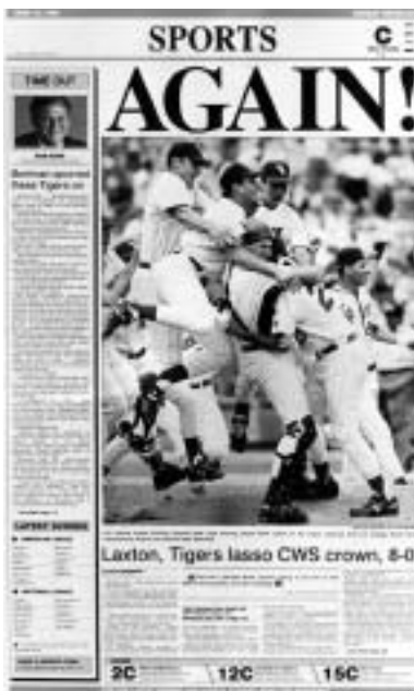
The June 13, 1993, headline of the Baton Rouge Advocate heralds LSU's second CWS title.