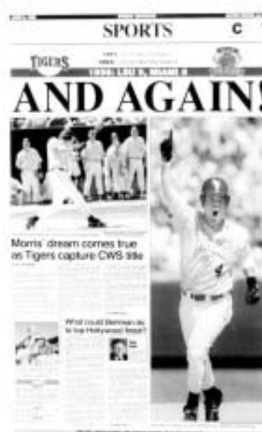
The June 9, 1996, headline of the Baton Rouge Sunday Advocate heralds LSU's CWS title.

The CWS championship capped a long list of achievements for the 1996 Tigers, including establishing an SEC record with 131 home runs on the season. The Tigers posted a 52-15 record, marking LSU's sixth 50-win season in eight years and the seventh in school history. LSU recorded a 20-10 SEC mark, sharing the conference title with