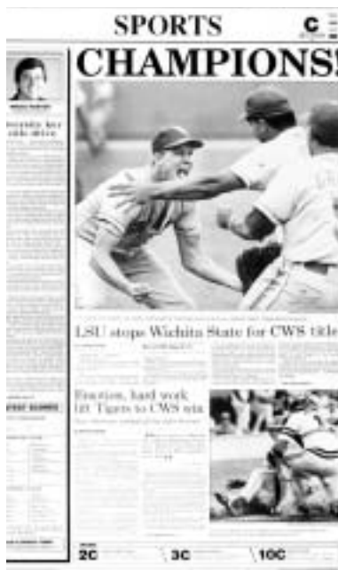
The June 9, 1991, headline of the Baton Rouge Sunday Advocate heralds LSU's CWS title.