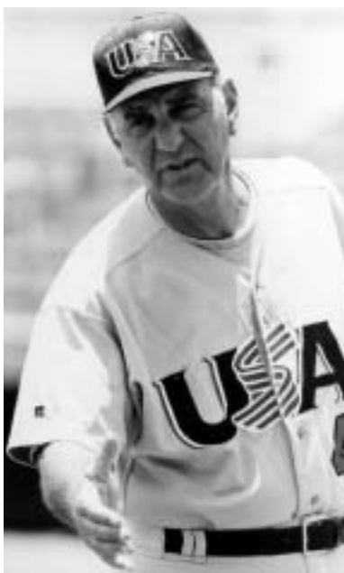
Skip Bertman guided the U.S. to the bronze medal at the 1996 Olympics in Atlanta.

In addition to the five national championships (1991, 1993, 1996, 1997, 2000) Bertman's LSU teams also claimed seven SEC championships, nine 50-win seasons, 11 CWS berths and six SEC Tournament championships.