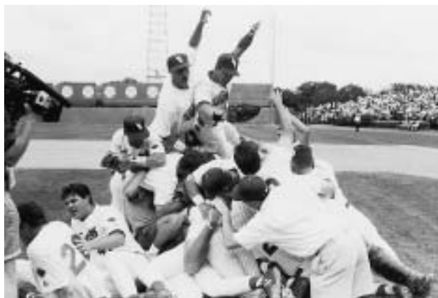
The Tigers won their second NCAA title in the 100th anniversary season of LSU Baseball.