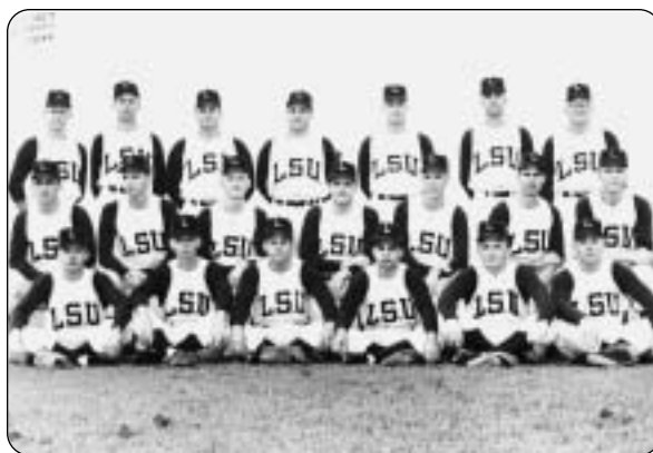
1961 SEC Champions

played on a field located on the Campanile Parade Grounds. In 1936, the playing field was located north of the football stadium and was equipped with wooden bleachers. In 1938, LSU baseball moved into what was later to be named Alex Box Stadium, the present home of the Fighting Tigers.