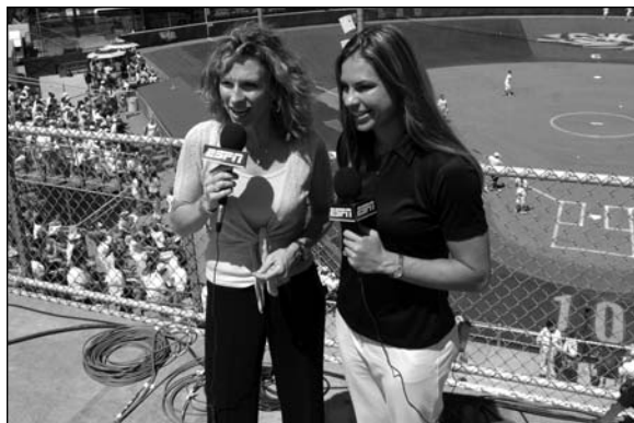
Last season, ESPN made its first trip to Tiger Park with analysts Beth Mowins and Jessica Mendoza covering two of the three games in the series against No. 1 Tennessee.