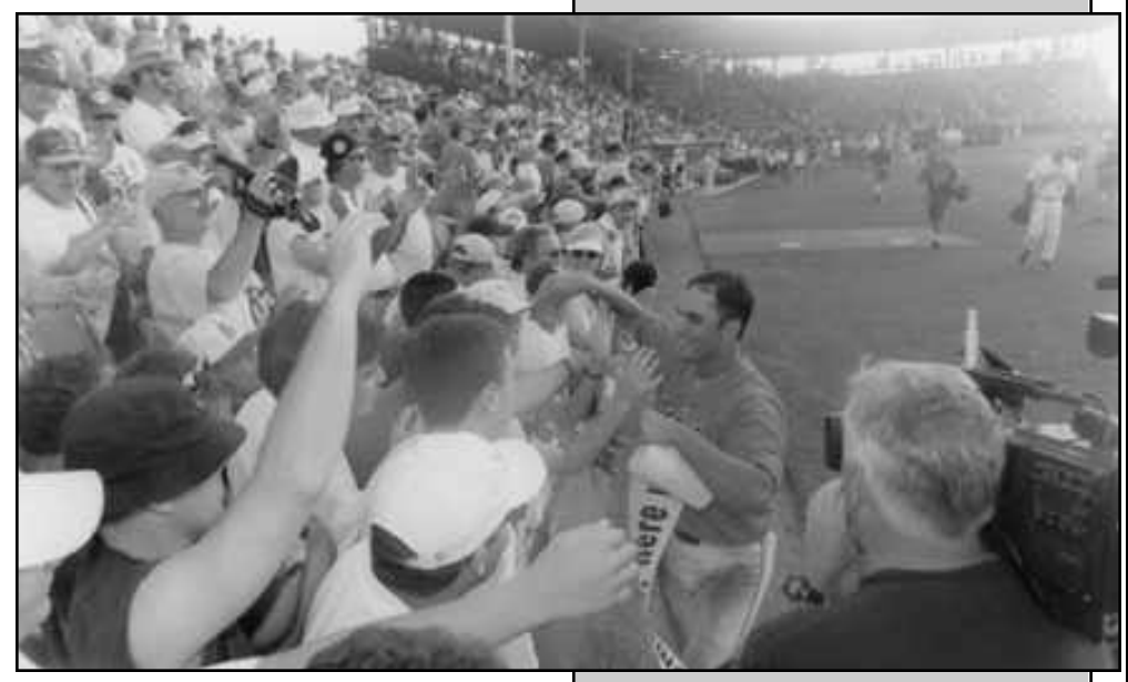
LSU has led the nation in attendance in each of the last six seasons. The Tigers drew an average of 7,476 fans to Alex Box Stadium in 2001.

Todd Walker was voted in 1996 as the second baseman on the College World Series All-Time Team by the readers of the Omaha