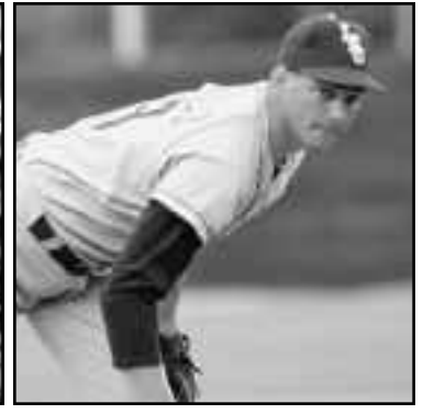
Ben McDonald 1989 National Player of the Year