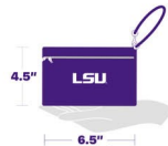
SMALL CLUTCH PURSE No larger than 4½ x 6½"