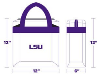
CLEAR TOTE Plastic, Vinyl, or PVC and no larger than 12" x 6" x 12"