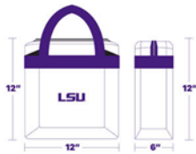
CLEAR TOTE Plastic, Vinyl, or PVC and no larger than 12" x 6" x 12"