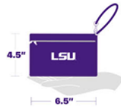
SMALL CLUTCH PURSE No larger than 4½ x 6½"