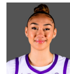
Last-Tear Poa G • 5-11 • So. Melbourne, Australia