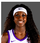
Flau'Jae Johnson G • 5-10 • Fr. Savannah, Georgia