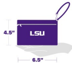
SMALL CLUTCH PURSE No larger than 4½ x 6½"