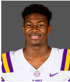
52 Princeton Malbrue Defensive End 6-2 · 220 · So./1L Carencro, La. (Lafayette Christian Academy/ Northwestern State)

Played in a reserve role in Week 2 vs. Grambling.