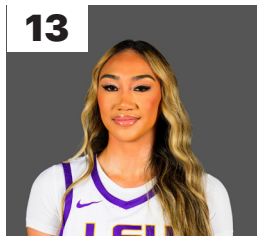
13 Last-Tear Poa G | 5-11 | JR Melbourne, Aus.