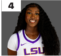
4 Flau'Jae Johnson G | 5-10 | SO Savannah, Ga.