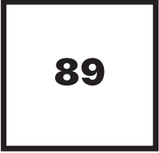
LSU's margin of victory against McNeese - a program record