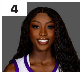
4 Flau'Jae Johnson G | 5-10 | JR Savannah, Ga.