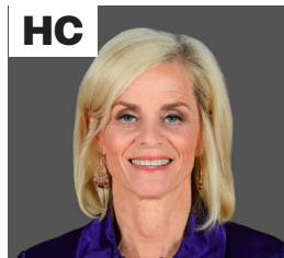
Kim Mulkey Tangipahoa Parish, La.