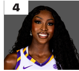
Flau'jae Johnson G | 5-10 | SR Savannah, Ga.