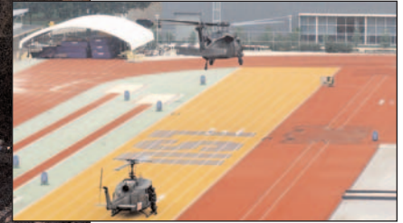
ABOVE: The track at Bernie Moore Stadium was used as a landing pad for helicopters with rescued citizens from the flood areas.