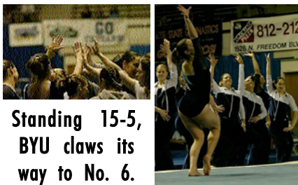
Standing 15-5, BYU claws its way to No. 6.

The Cougars finished their season scoring a 197.800 against Utah (198.600), bringing the team to 15-5 overall record.