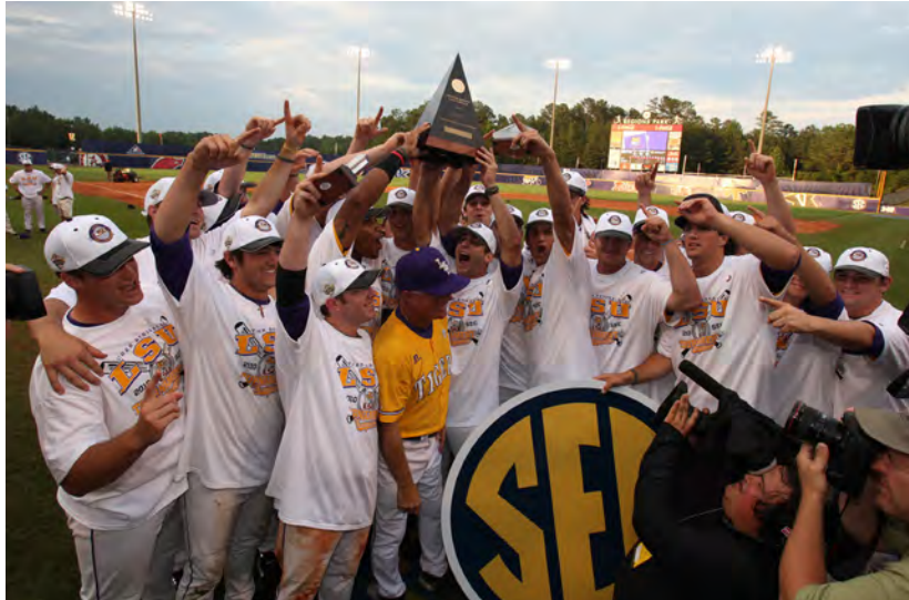
LSU raises the 2010 SEC Tournament Championship Trophy. The Tigers have won nine overall SEC titles and three in a row.