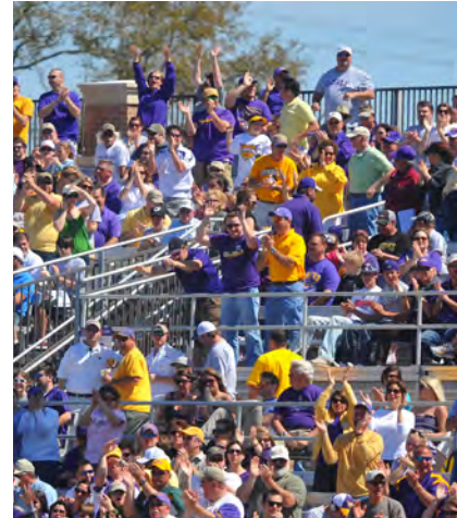
LSU is No. 1 in the 2010 college baseball attendance rankings by the NCAA, marking the 15th straight season in which the Tigers have led the nation in total attendance.