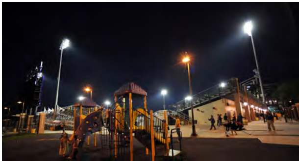
In both the right and left field corners of Alex Box Stadium are playground areas for kids.

Individual game baseball tickets for select games go on sale each February. The cost of a home game baseball ticket is $15 for grandstand seats and $10 (adults) and $5 (youth ages 3-12) for bleacher seats. All phone and internet orders are subject to applicable service fees.