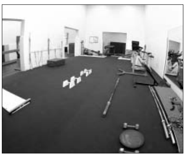
In-gym rehabilitation and conditioning area

"Young female athletes are coming to the realization across the spectrum that opportunities are out there for them. They can take scholarships and compete at the collegiate level. So I think maintaining a quality training environment is very important."