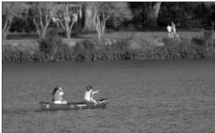
The University lakes on the LSU campus give various recreational options.

Having witnessed many of yesterday's possibilities become today's tangible realities, the LSU community set forth to capitalize on its success. The goal was to improve our standing as a nationally competitive flagship university. Following intense discussions among the LSU Board of Supervisors, campus administrators, faculty, and student leaders, the objectives required to reach this status crystallized, providing the impetus for LSU's National Flagship Agenda.