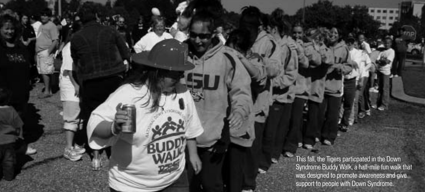
This fall, the Tigers participated in the Down Syndrome Buddy Walk, a half-mile fun walk that was designed to promote awareness and give support to people with Down Syndrome.