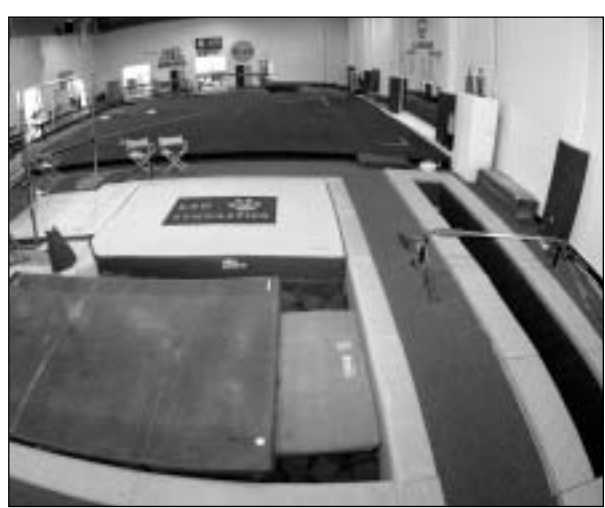
LSU's 18,143 square foot practice facility