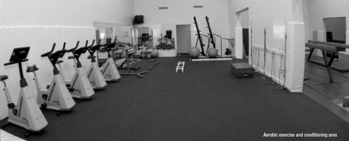
Aerobic exercise and conditioning area

“When girls come to visit our facility they are impressed. They are able to look out and see the other athletic facilities, and they are able to grasp the entire experience they are looking at if they choose to attend LSU.”