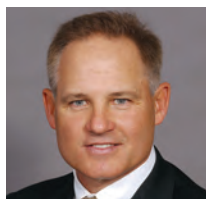
Les Miles FOOTBALL SEC Finish: 1st National Rank: 2nd 2011 SEC Champions 2011 BCS Championship Game Participant