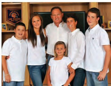
Les and Kathy Miles with their four children, Ben, Smacker, Macy and Manny.

On the field the Tigers have won more games (75) than any other program in the SEC, finished in the nation's top 10 five times and delivered a league-best 42 NFL Draft picks, including 10 first round selections. LSU's also produced 16 first team All-Americans and had players win 11