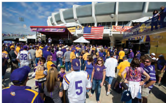
Tiger One Village provides LSU Fans the ultimate pre-game atmosphere.