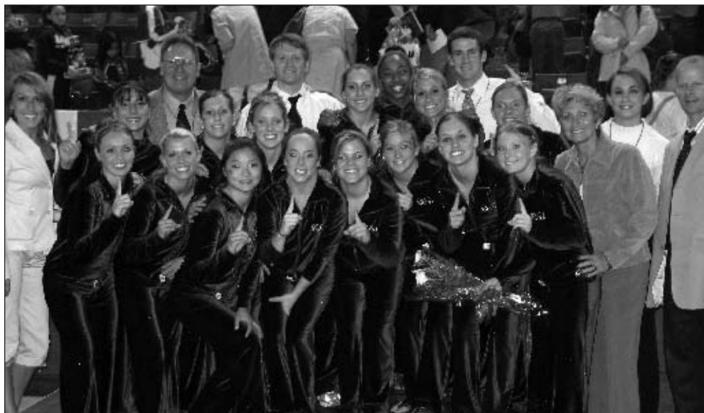
2005 NCAA Northeast Regional Champions