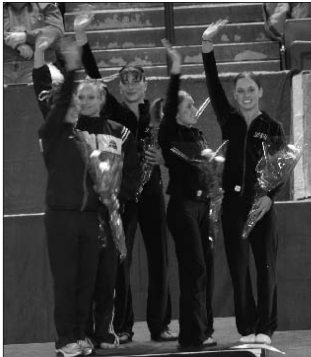
2005 NCAA Northeast Regional Beam Champions