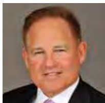
Les Miles FOOTBALL SEC Finish: 3rd in West, Tied for 4th overall National Rank: 14th Coaches Poll, 14th in AP Poll