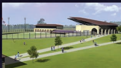
The new Tiger Park