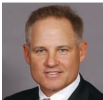
Les Miles FOOTBALL SEC FINISH: 1st NATIONAL RANK: 1st National Champions