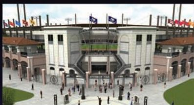
The new Alex Box Stadium

TAF's primary goal in supporting LSU Athletics is to ensure that each student-athlete has the opportunity to be a student first and obtain the education necessary to prepare them for the future. In an effort to permanently fund LSU athletic scholarships in each sport, TAF is offering the opportunity to support the "Foundation of Champions" scholarship endowment program. The program's purpose will be to provide a perpetual source of financial support for athletic scholarships through a general scholarship endowment fund.