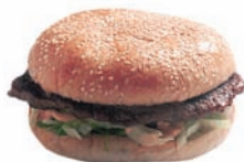
No Food and Drink