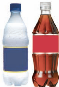
No Glass or Plastic Bottles