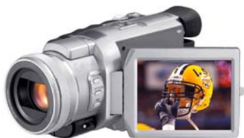
No Video Recording Devices