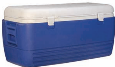
No Ice Chests or Coolers