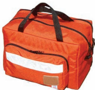
No Bags Larger than 8.5" x 11"