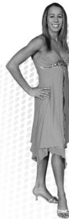
All-Around Freshman • 5-3 Homestead, Fla. American Major: Kinesiology

I just knew it was where I wanted to come once I stepped on campus.