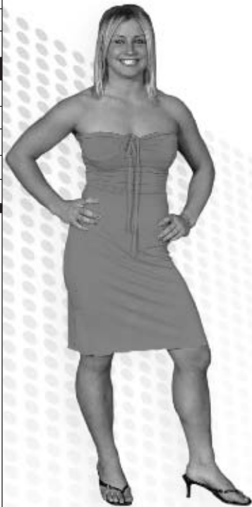
All-Around Freshman • 5-1 Burlington, Ontario, Canada Notre Dame Secondary Major: Undeclared