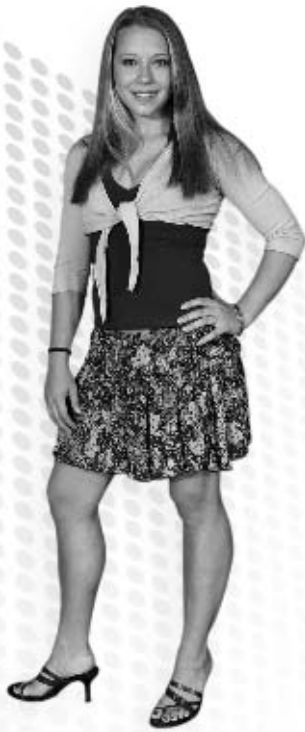
All-Around Freshman • 5-1 Windermere, Fla. Lake Highland Major: Kinesiology