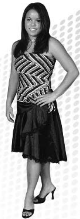
All-Around Freshman • 5-2 Covington, La. Covington HS Major: Psychology

A good balance of strong academics and athletics.